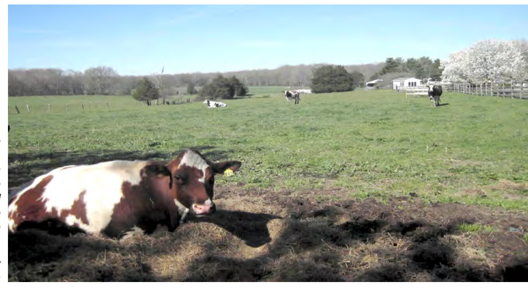
The Chard farm in Alloway Township, Salem County, was preserved through the Municipal Planning Incentive Grant Program in April 2016.