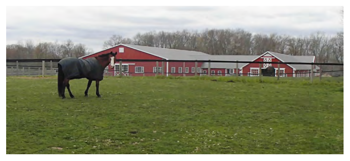
The SADC preserved the Hamorski and Salatiello farm in Lebanon Township, Hunterdon County, in August 2015 through its Direct Easement Purchase Program.

Landowners may choose to preserve their land for agricultural purposes for a minimum of eight years, rather than permanently. While they do not receive compensation for this, they do qualify for certain benefits of the permanent preservation program, including eligibility to apply for cost-sharing grants for soil and water conservation projects when such funding is available. At fiscal year's end, 78 farms totaling 4,643 acres were enrolled in eight-year programs.