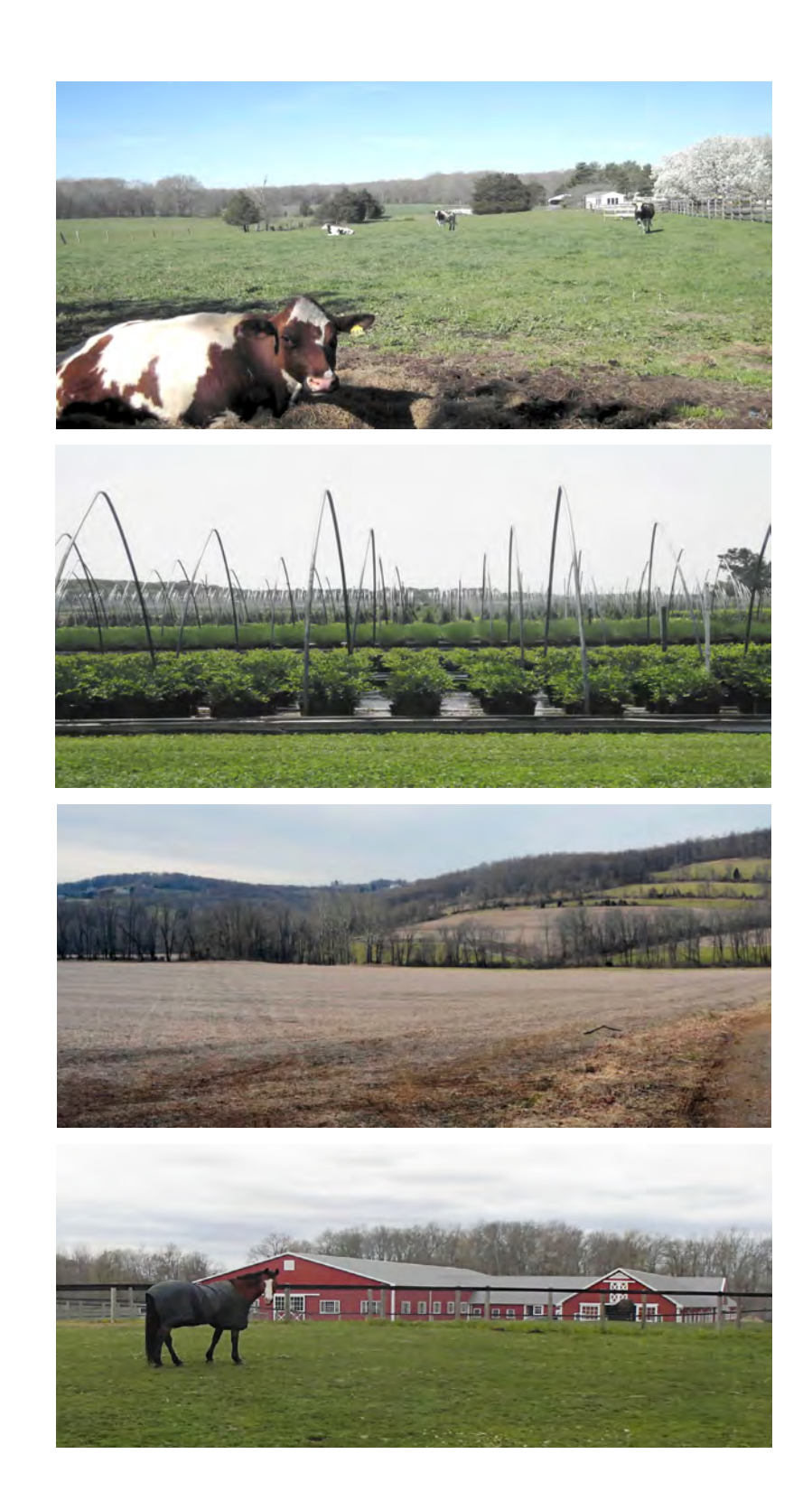
N.J. State Agriculture Development Committee