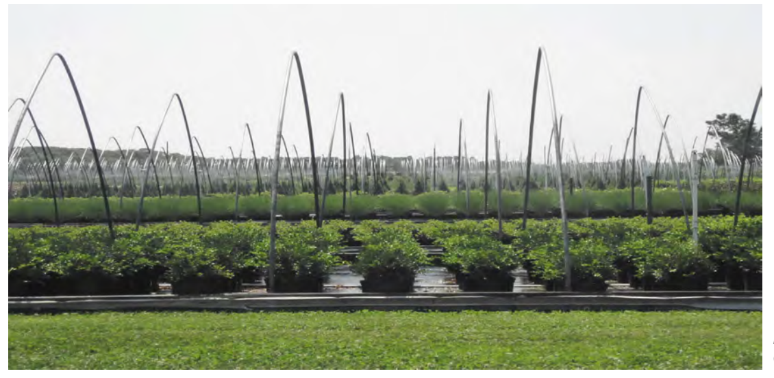
The Overstreet/ Chiari farm in Upper Deerfield Township, Cumberland County, was preserved through the Municipal Planning Incentive Grant Program in July 2015.