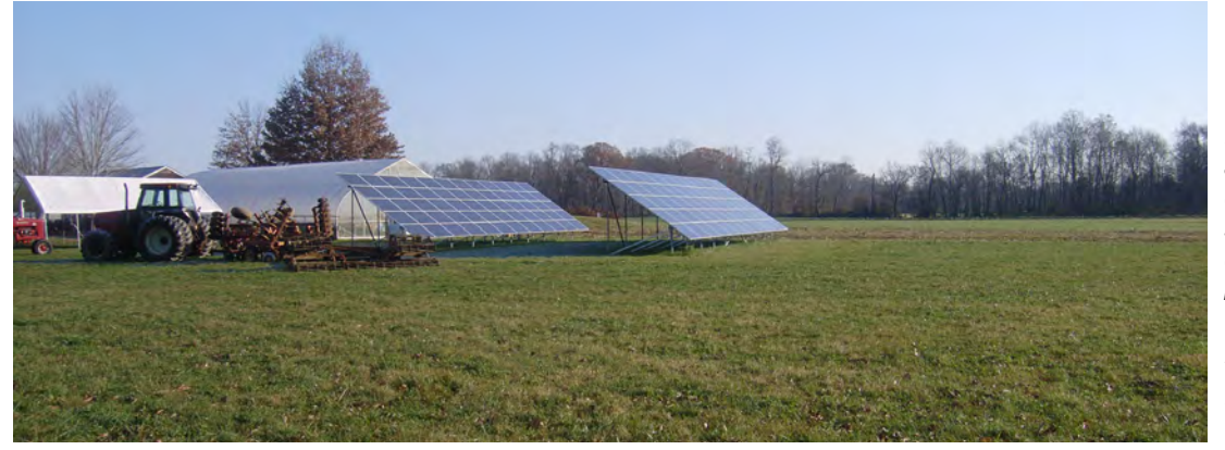
The SADC in December 2015 approved an expansion of this solar energy facility on the Hlubik farm in Chesterfield Township, Burlington County.

buffers to stabilize soil and control runoff.