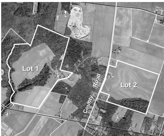
Diagram of a Non-Contiguous Division