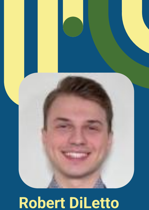
BPU Data Analyst Trainee