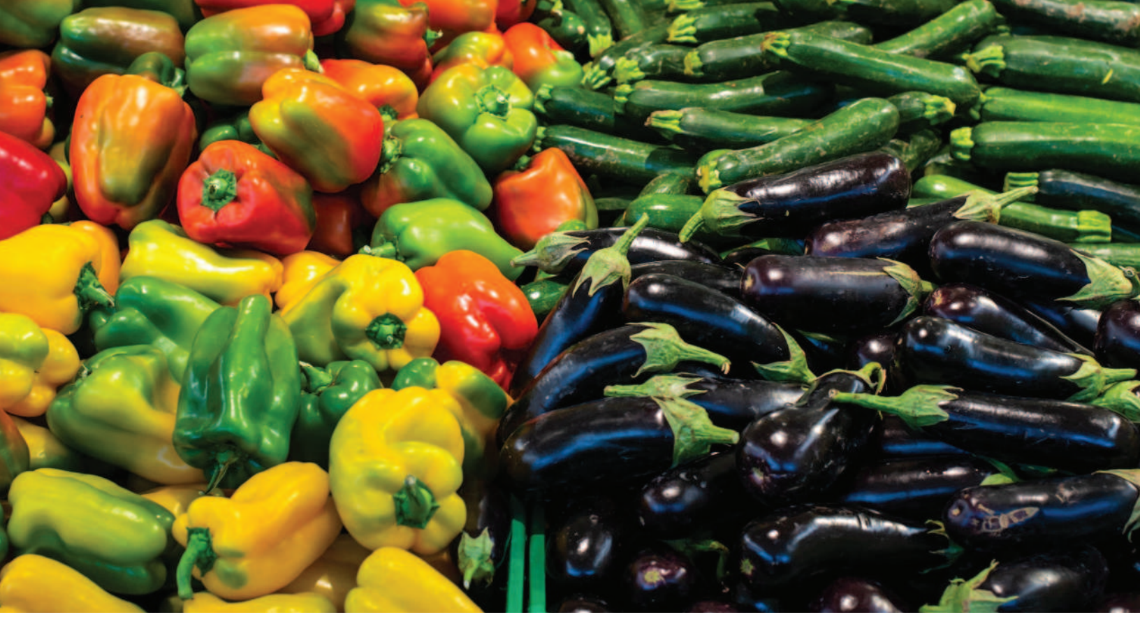
The 2019 growing season at Bayside yielded 5,850 pounds of produce that Bayside State Prison donated to a local food bank.