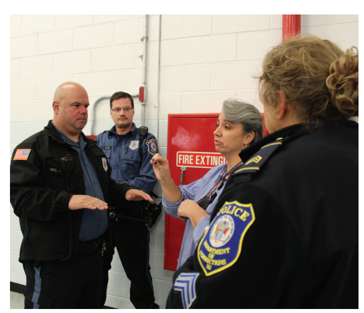
NJDOC medical and custody staff demonstrate how to safely and effectively administer Buprenorphine, one of several medications utilized in the correctional MAT program.

Encouraging the county jail system to offer more immediate access to addictions treatment for people in custody is a key component for better outcomes when the treatment is coordinated through a statewide plan.