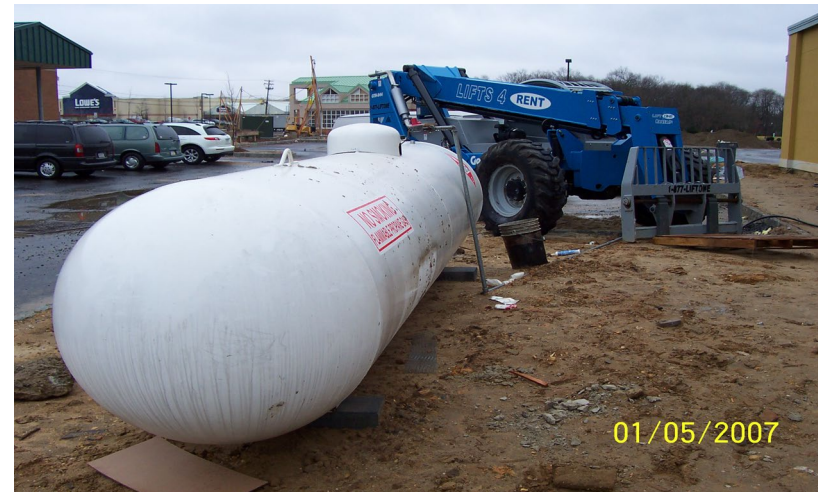
Tanks need to be placed on firm stable earth and be protected from construction vehicle traffic