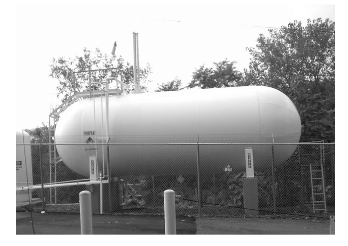
Figure III-3 Propane tank.

Caution Any decision to approach a propane tank showing direct flame impingement on its vapor space must be made on a case-by-case basis after evaluating the hazards and risks and determining if an adequate supply of water is available to support firefighting operations. Bulk storage tanks can fail within 10 to 20 minutes of direct flame impingement if the containers are not adequately cooled, Figure III-3.