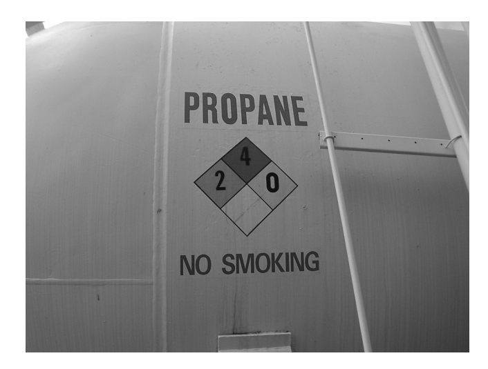
Figure III-2 Propane placard.

balance of the container). Cooling the container will cause the pressure to be reduced, thus closing any relieving container relief valve that might be feeding the fire. Do not extinguish the fire until the propane fuel supply can be shut off. If a container service valve is controlling the fuel feeding the fire, the surrounding atmosphere should be cooled with converging fog streams while the fire service attempts to close the valve. Continue to cool the container well after the fire has been extinguished. The area around the container should be monitored for flammable gas using a combustible gas indicator.