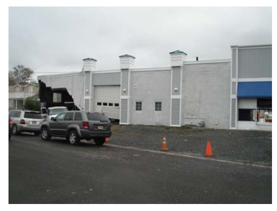
Figure 4 Figure 5

Extensive clean up was needed as nearly fifty boats were tossed throughout the town. Figures 4 and 5 below show the damage to Shark River Municipal Marina. Map 1 , taken from Google Earth a week after the Storm, shows an aerial view of the damaged docks and Marina building as well as the boats and debris that were tossed around the surrounding areas.