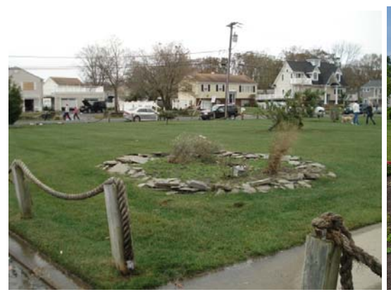
Figure 8 Figure 9

Two parks that received substantial damage from the Storm were Volunteer Park and Memorial Park, both in Shark River Hills. Neptune Township's Environmental Commission developed a program to replant much of Volunteer Park which was destroyed by Superstorm Sandy. The Commission installed plants and shrubs that are adapted to coastal environments, salt tolerant and require little watering once established. The Township also provided a new gazebo and benches. Figure 8 shows damage to Riverside Park and Figure 9 depicts the improvements completed by the Environmental Commission. As previously mentioned Memorial Park suffered the most costly amount of damage and needed replacement of fencing, trees and playground equipment. The park was repaired and rededicated in May of 2013.