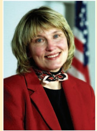
Holly Bakke Commissioner of the Department of Banking and Insurance