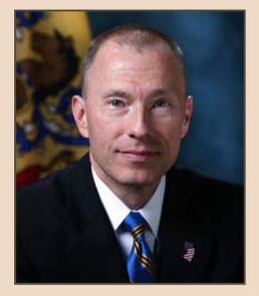
KENNETH E. KOBYLOWSKI Acting Commissioner Department of Banking & Insurance