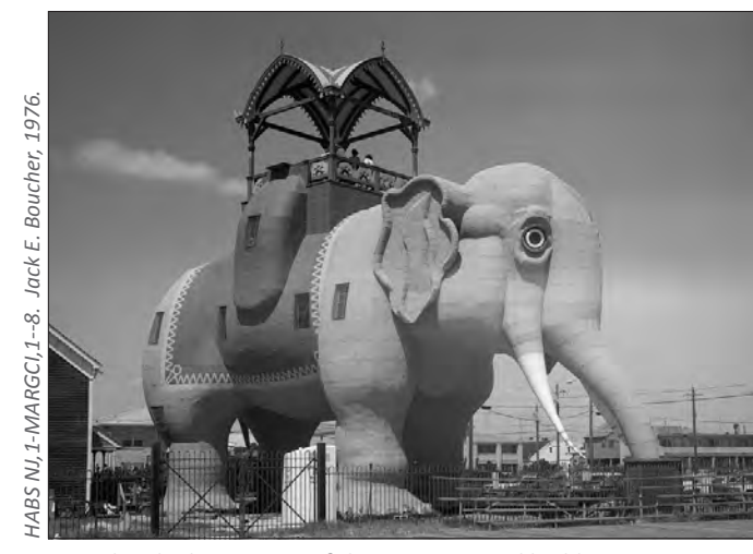
Lucy the Elephant is one of the more unusual buildings in New Jersey. Preservation of Lucy the Elephant required addressing moisture-induced deterioration of the wood sheathing that holds the metal skin in place.

When owners and stewards commission a planning document, they should understand the meaning of the various treatment options and the potential use of the document to outline future work at a site, the likely outcome of fund raising efforts or funding agency requirements. Potential funding agencies and the New Jersey Historic Preservation Office (HPO), if involved, will review the final document and its recommendations for conformance and consistency with the appropriate treatments as defined by the Standards. Recommendations of specific treatments in Historic Structure Reports, Preservation Plans and amendments should be in conformance with the overall Standards or they may not be eligible for state or federal funding or reimbursement by other funding agencies. If work is completed based upon the nonconforming recommendations, it may result in the loss of important building materials or fabric or an inconsistent interpretive history.