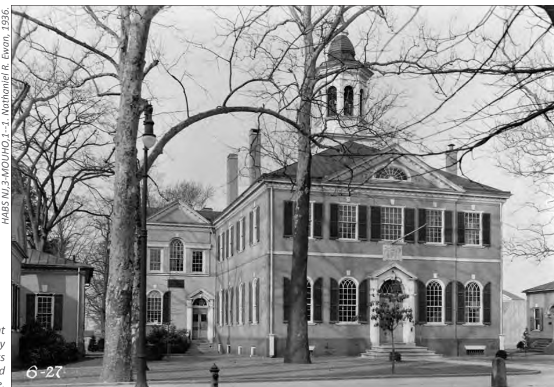
A detailed assessment of the Burlington County Courthouse resulted in its restoration and continued reuse.