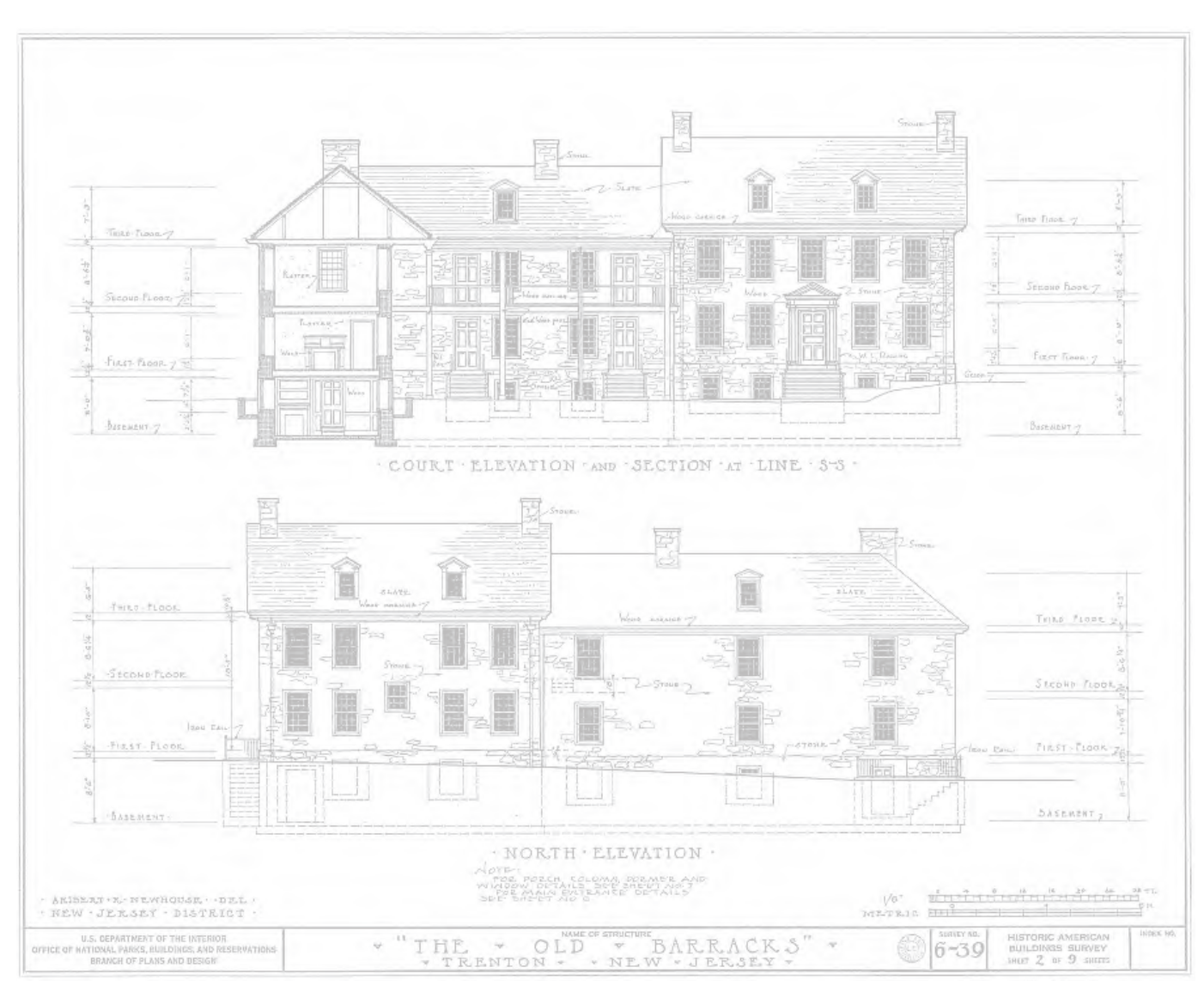
Measured drawings, such as this plan of the Old Barracks, can be a helpful tool to clarify existing conditions and note areas of deterioration. HABS NJ,11-TRET,4- (sheet 2 of 9) - Old Barracks, South Willow Street, Trenton, Mercer County, NJ.