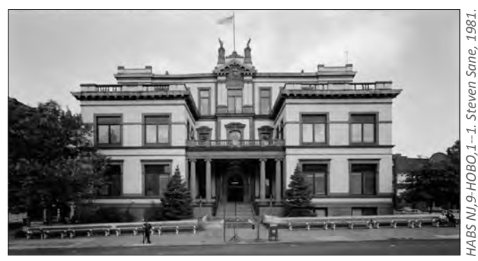
The Preservation Plan for the Hoboken City Hall was prepared by an experienced team of preservation professionals including architects, engineers, a conservator and a cost estimator.