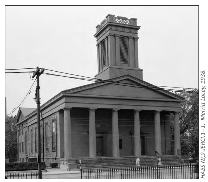
Old Bergen Church, Jersey City.