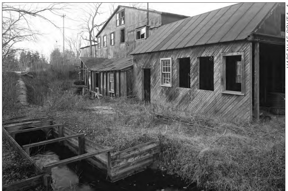
HABS NJ,15-DOUT,1 David Ames, 1991.

When considering the preparation of a HSR or PP, the complexity of the site will help to identify the potential consultants required to complete the work. The sawmill at Double Trouble State Park in Ocean County is a wood framed building with a specific relationship to the adjacent waterway. In addition to a preservation architect and architectural historian, appropriate consultants could include a structural engineer, landscape architect, site/civil engineer, and potentially an archaeologist.