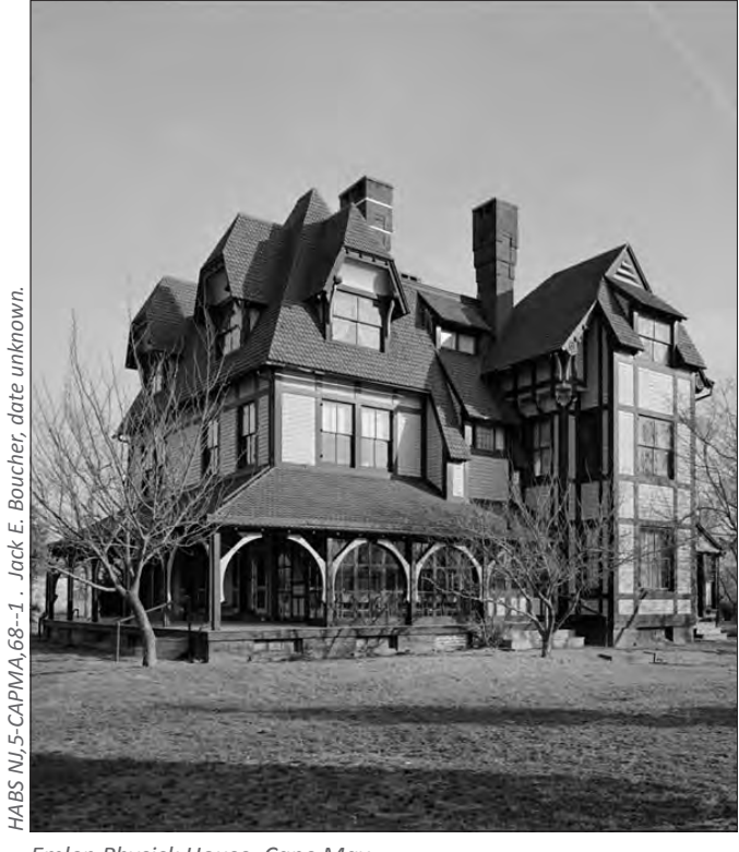
Emlen Physick House, Cape May.

Since they are typically prepared in anticipation of a specific project, the long-term benefit of a PP as a resource document is considerably less than a HSR. However, PPs can be supplemented and updated to reflect the depth of information found in a HSR.