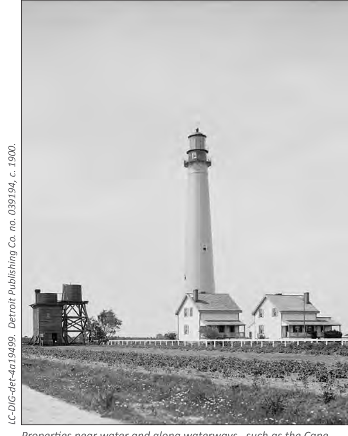
Properties near water and along waterways, such as the Cape May Light House, are more susceptible to flooding and potential coastal storms.

When completing a significant intervention or construction project, it is also prudent to ensure contractors minimize risk associated with the work including limiting or restricting welding operations, limiting or prohibiting flammable or toxic materials, providing adequate security, and requiring the prompt removal of construction debris and rubbish.