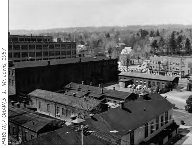
Sites with multiple buildings, such as the Thomas A. Edison Laboratories, Essex County, NJ, will be more expensive to document than sites with one building.

As noted in the Cost of a HSR or PP section at right, it is important to keep in mind that printing multiple copies of draft and final documents, particularly in color, can be costly. One way to mitigate costs and provide an easy and inexpensive means of sharing the completed document with those who will ultimately implement recommendations and/ or prepare future amendments is to request a digital copy of the final document. This can be provided by the consultant on a flash drive or similar device, and copied to multiple computers, both on and off-site. Digital copies also provide a means for the consultant team to share high-resolution photographs of the property with owners and stewards. These images can record the property's condition at the time of document preparation that can be invaluable to future caretakers of the site. If appropriate, sections of the document, such as the history of the property and historic images, can also be shared though web sites, potentially increasing public interest and awareness in the resource.