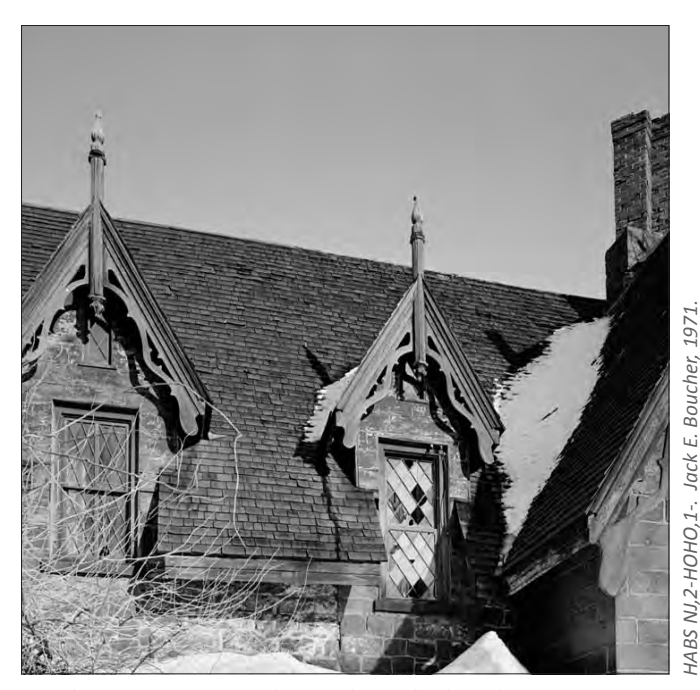
Regular maintenance, such as replacing broken glass as seen in the photograph from the Hermitage (Ho-Ho-Kus), can reduce vulnerabilities and hazards at a property.