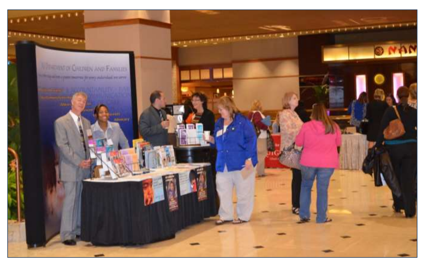
2013 New Jersey Taskforce Biennial Conference, "Transitions: From Infancy to Adulthood"

The Task Force is currently preparing for its skill-building conference on trauma-informed care in September 2014.