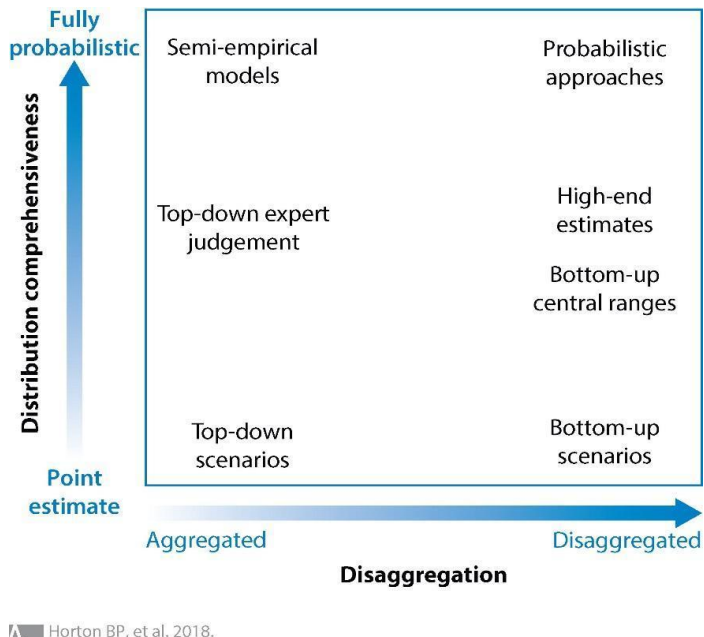
Annu. Rev. Environ. Resour. 43:481–521