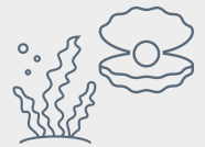
Aquatic Resources & Habitats