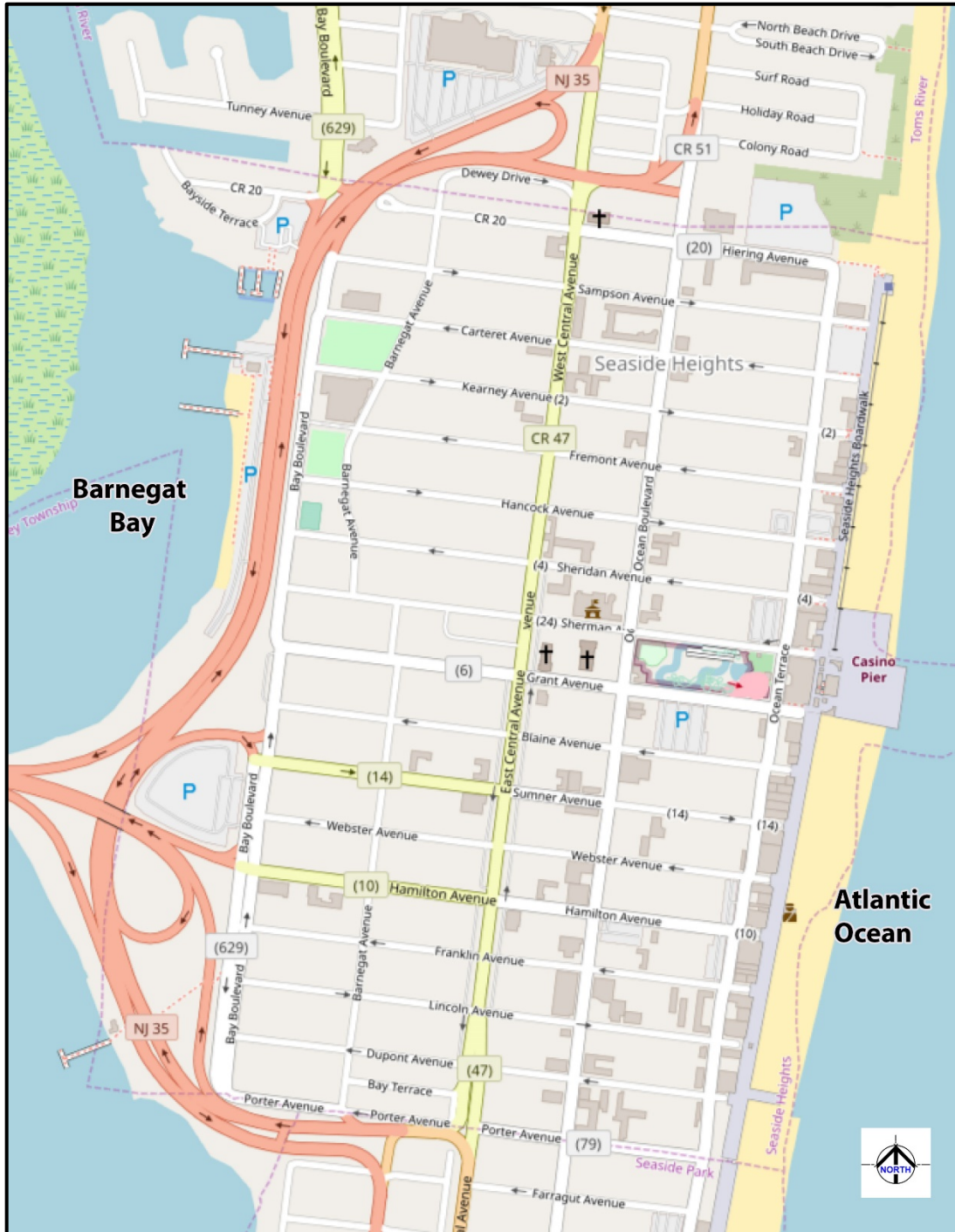
Map 1: Proximity to Tidal Waterways

The Borough of Seaside Heights (Borough) is a barrier island community located between Barnegat Bay and the Atlantic Ocean in northeastern Ocean County, New Jersey.