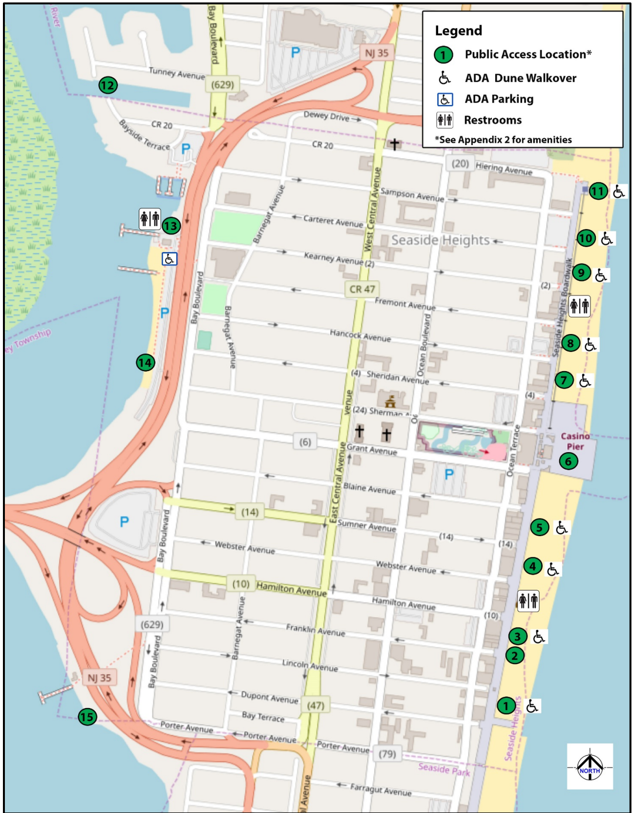
Map 2: Existing Public Access Locations