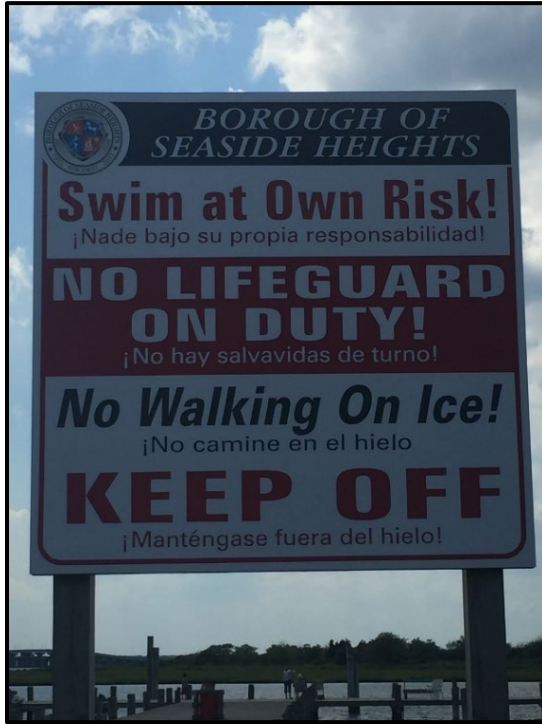
North Pier Signage