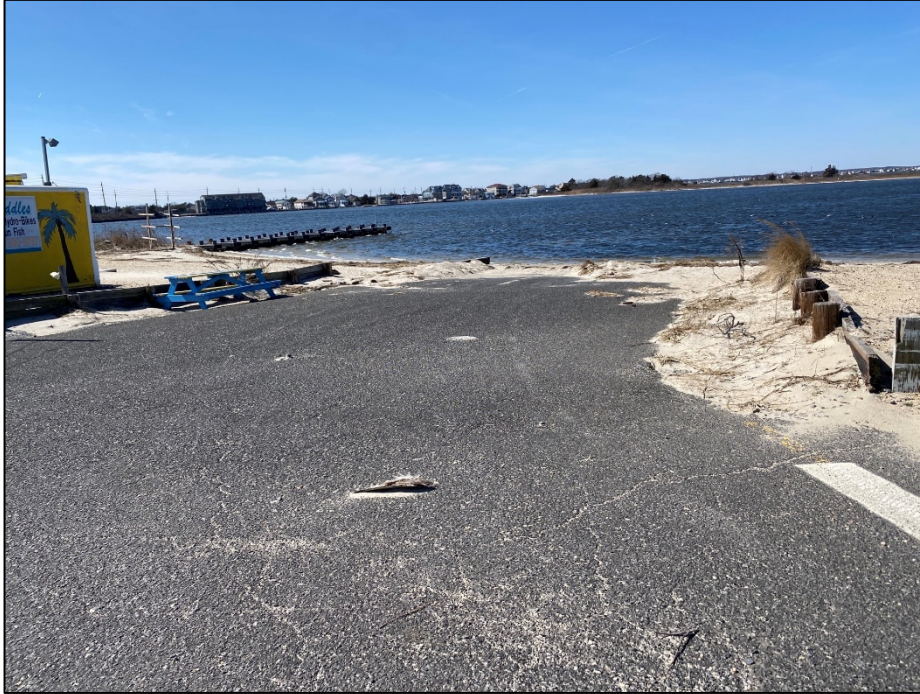
Public Boat Ramp at Sunset Beach