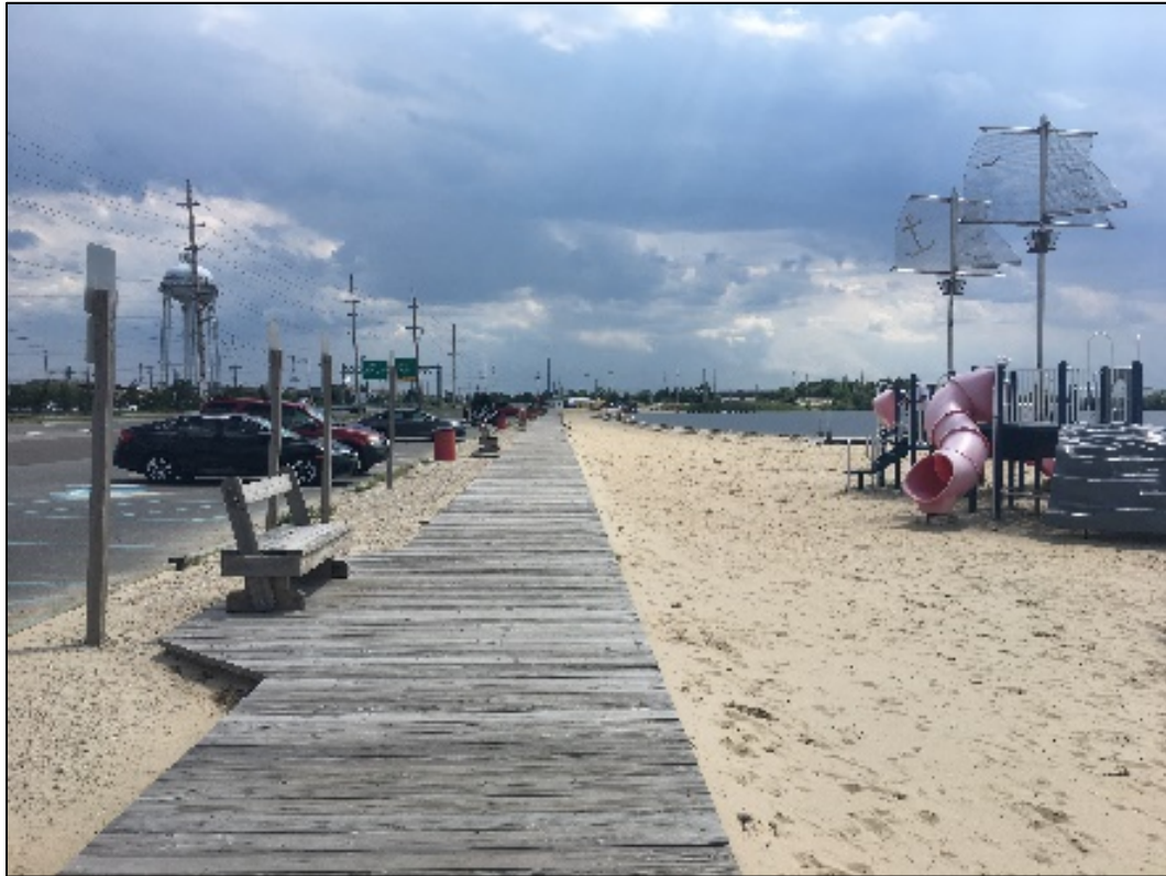
Boardwalk at Sunset Beach

Sunset Beach offers numerous amenities, including: