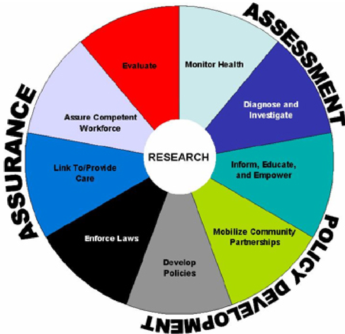
THREE CORE FUNCTIONS OF PUBLIC HEALTH