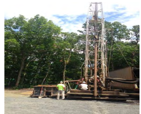
Drilling of a Drinking Water Well at the Berkeley Twp. MUA