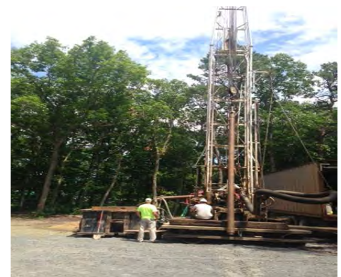
Drilling of a Drinking Water Well at the Berkeley Twp. MUA