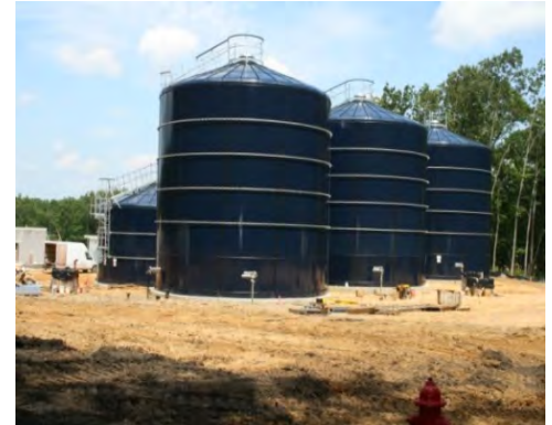
Construction of Storage Tanks at the Jackson Twp. MUA