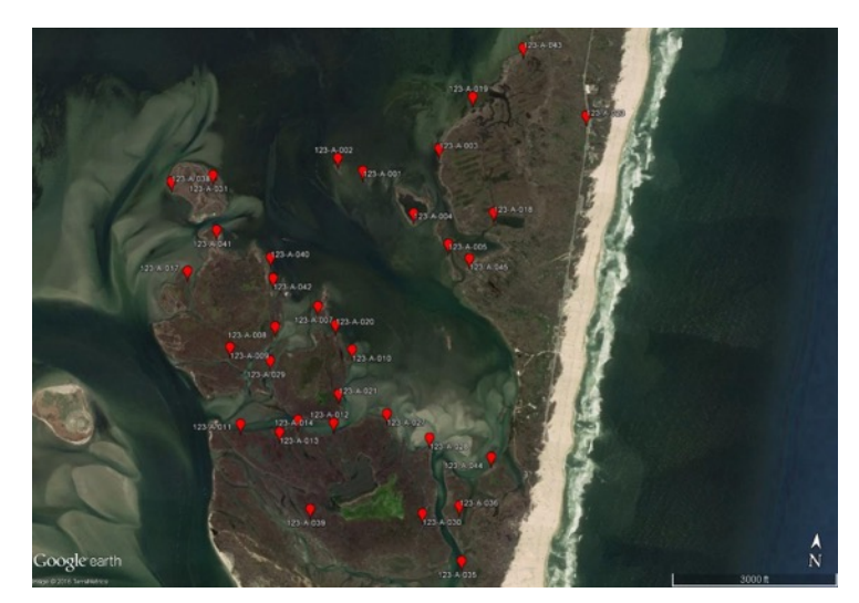
Nests located inside Sedge Island WMA, Barnegat Bay.

This year our team of trained nest observers conducted ground and boat surveys in all areas from Sandy Hook and south to Cape May, then west along the Delaware bayshore and up the Maurice River. These surveys are conducted in the most densely populated osprey nesting colonies. Our observers visit as many nests as possible and record whether a nest is active and how many young were produced. While there, if young are more than 3 weeks old, they are banded with a USGS bird band for