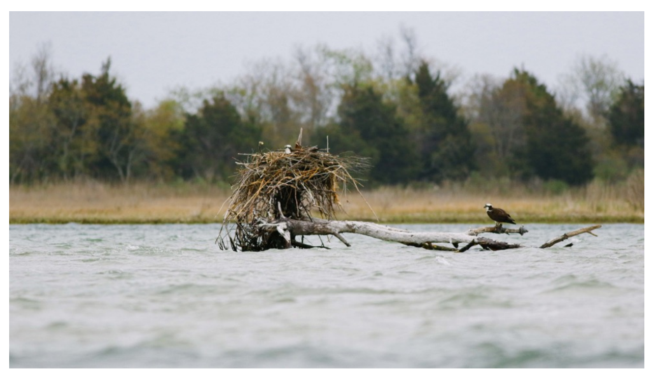
A natural nest inside Barnegat Inlet, Barnegat Light, New Jersey.

It was hard to determine the exact damage since we did not conduct a pre-storm survey, but <u>our</u> results showed that of 50 nests surveyed, 15 had sustained damage, causing nestling mortality. Only one nestling was found alive and was successfully returned to its nest. As a result of this storm, we've pledged to conduct more preventive maintenance to osprey nesting platforms to help ensure they can withstand high winds events. Your continued financial support allows us to maintain a large quantity of high quality nesting platforms.