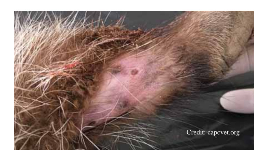
Image of rear leg of raccoon where female Dracunculus insignis have emerged. Those ruptured spots have healed in this image.

Gravid adult female Guinea worms are found in the space just under the skin of the front and hind legs, thorax, abdomen and groin. The front end of the pregnant female penetrates the skin resulting in the formation of a blister, then the blister will rupture and an ulcer forms. When the ulcerated area contacts water, the skin over the worm ruptures. First-stage larvae are then released into the water to be ingested by an intermediate host (i.e., a copepod commonly known as the water flea, or cyclops). The infected cyclops may contain from 1 to 23 larvae which will develop to the infective third-stage larvae in a few weeks.