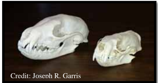
( Above, left and right ) Skulls of female fisher (on left in both images) and of a large mink (on right in both images). Note how small the mink skull is compared to the female fisher skull.

Note the short stubby legs, relative length of the tail compared to the body and ear size on the mink ( below left ) compared to the 4.4 lb. road-killed female fisher ( below right )