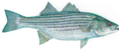
Striped Bass or Hybrid Striped Bass

1 fish at 28 inches to less than 43 inches