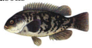
Tautog 15 inches