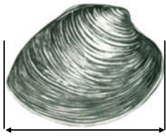
Hard Clam 1.5 inches