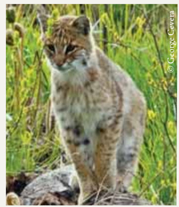
It is illegal to possess incidentally trapped or road-killed bobcat from New Jersey.