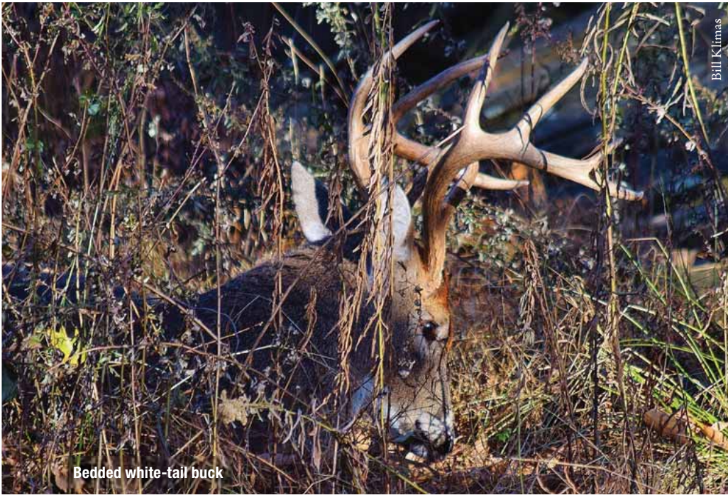
Bedded white-tail buck