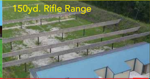
150yd. Rifle Range

VISIT OUR INDOOR & OUTDOOR FIREARM & ARCHERY RANGES OPEN TO THE PUBLIC—MEMBERSHIPS AVAILABLE