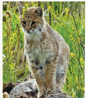
It is illegal to possess incidentally trapped or road-killed bobcat from New Jersey.