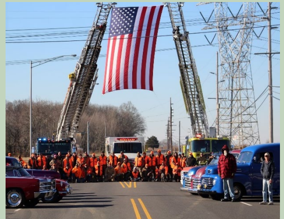
2022 Wounded Veteran Participants

The R3 Program, in partnership with Galant Heart of New Jersey, assisted in the 2022 annual pheasant tower shoot hunt. Just over 100 pheasants were distributed to 22 excited participants. The hunt program took place February 18th-20th allowing some of our nation's heroes to harvest these birds.