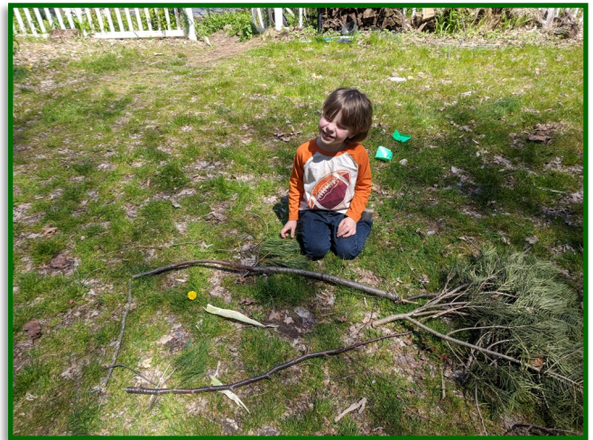
Fish made of sticks, pine branches, corn husks and dandelions.

Look up artists who have created nature art, such as Andy Goldsworthy, Andrew Rogers and Simon Beck to see how these land artists are using nature in art.