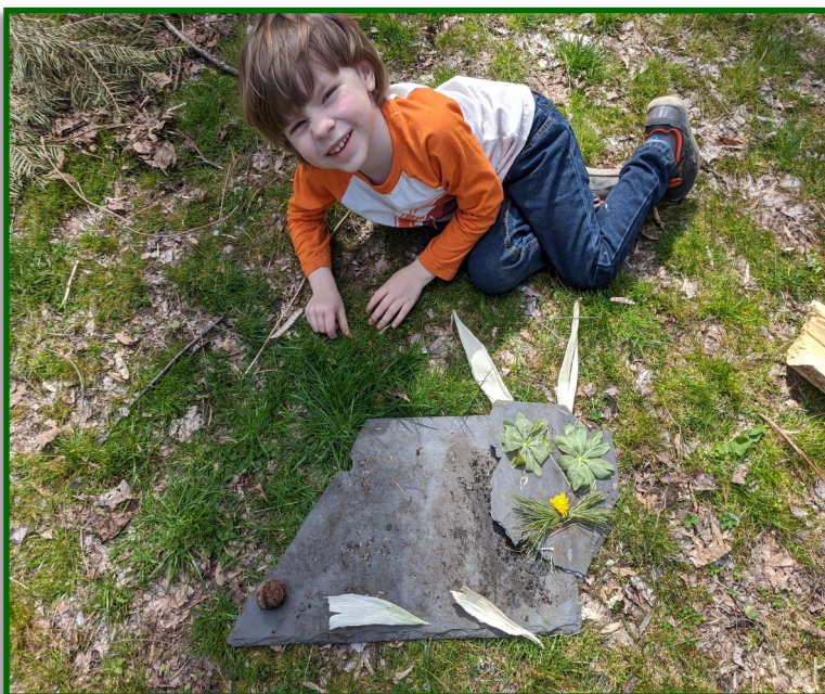
Rabbit made of slate, corn husks, mayapples, walnuts, pine needles and dandelions.