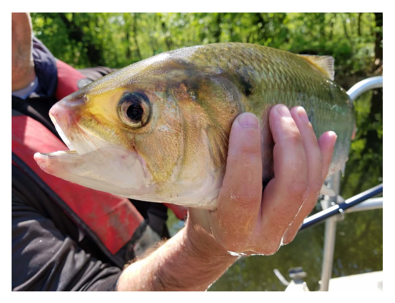
Adult American Shad captured by NJDFW during electrofishing surveys to monitor changes in the fish assemblage in the Millstone River

Shield Darter. All reasons why it is important to continue to monitor the dynamic fish populations of the Millstone River. There is no doubt that the "Mighty Millstone" is an underrated fishery, but don't just take my word for it. Enjoy the array of photos taken on the Millstone over the last two years.