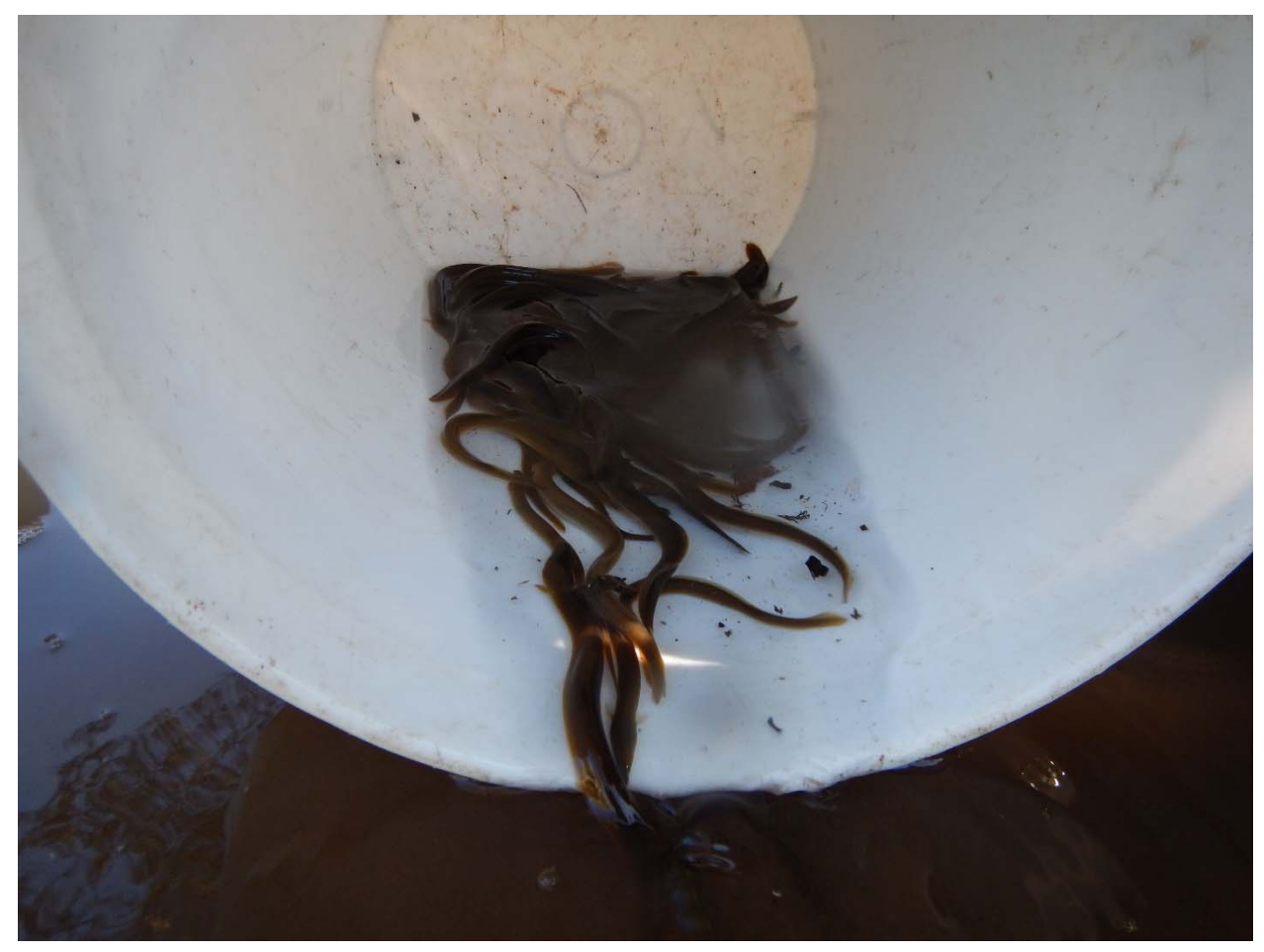
Abundance of young American Eels being counted and released following Millstone River electrofishing survey