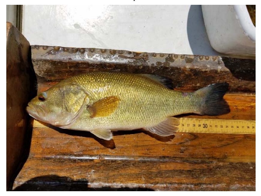
Robust 13.7 inch Largemouth Bass from Millstone River