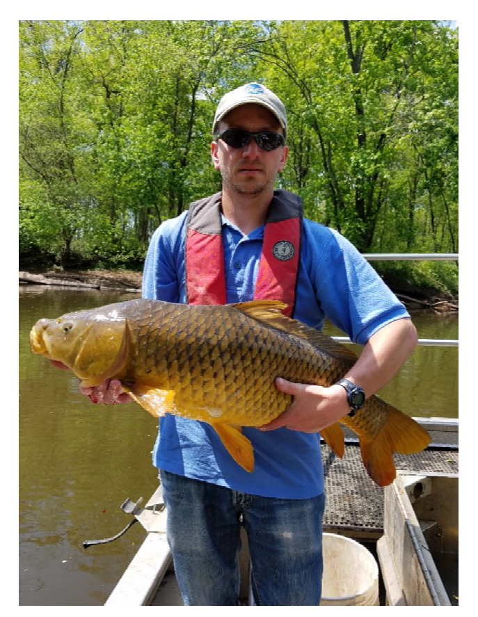
35-inch Common Carp from Millstone River estimated at over 25 pounds