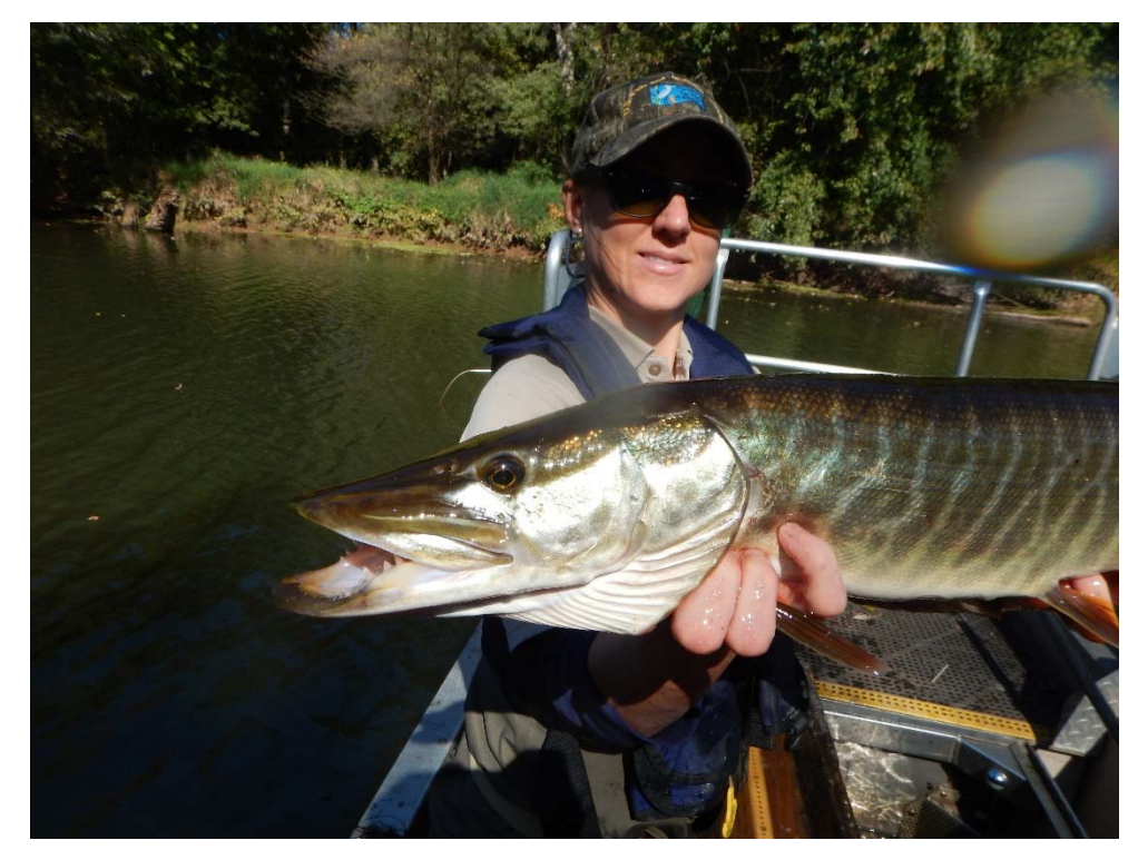
Surprise Musky captured in the lower Millstone River