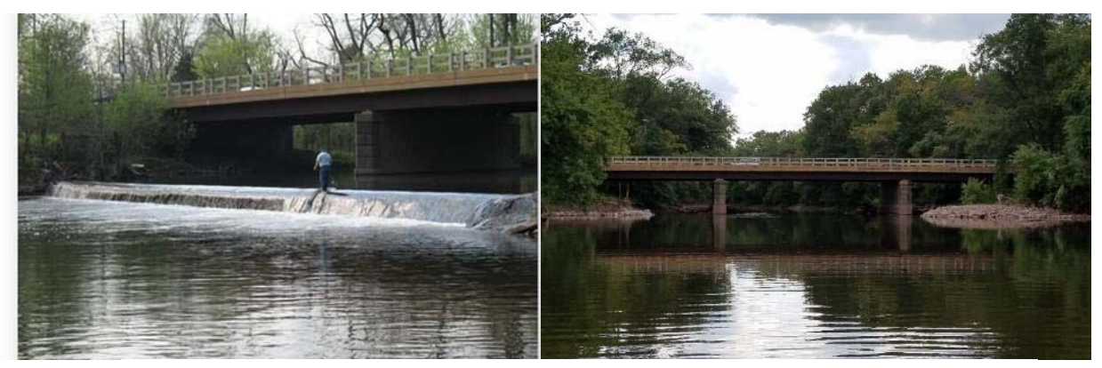
Weston Mill Dam (left) and after removal of dam (right).