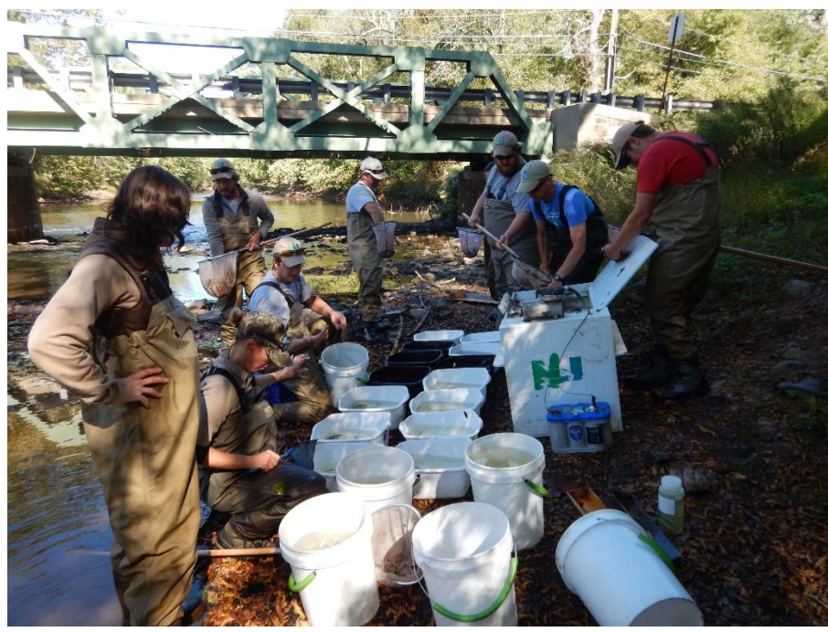
Field crew sorting through hundreds of fish near Griggstown Causeway.