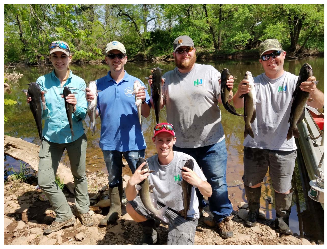
There is no shortage of Channel Catfish on the Millstone River, with most measuring 16-24 inches