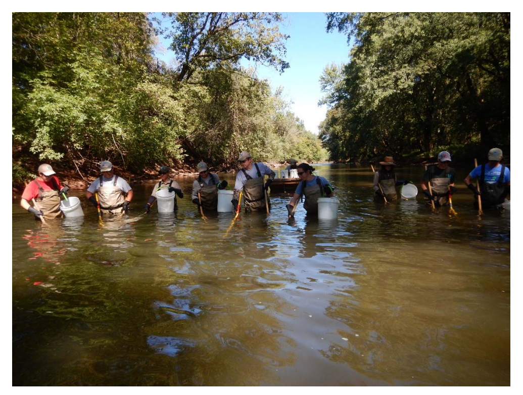
Crew of ten using electrofishing barge to capture fish near the Griggstown Causeway