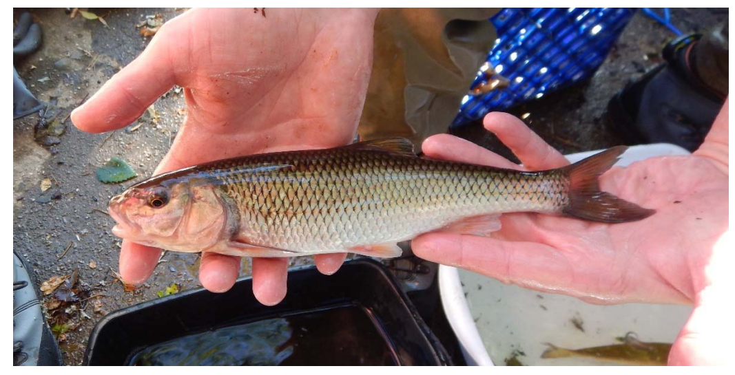
Fallfish captured during electrofishing survey