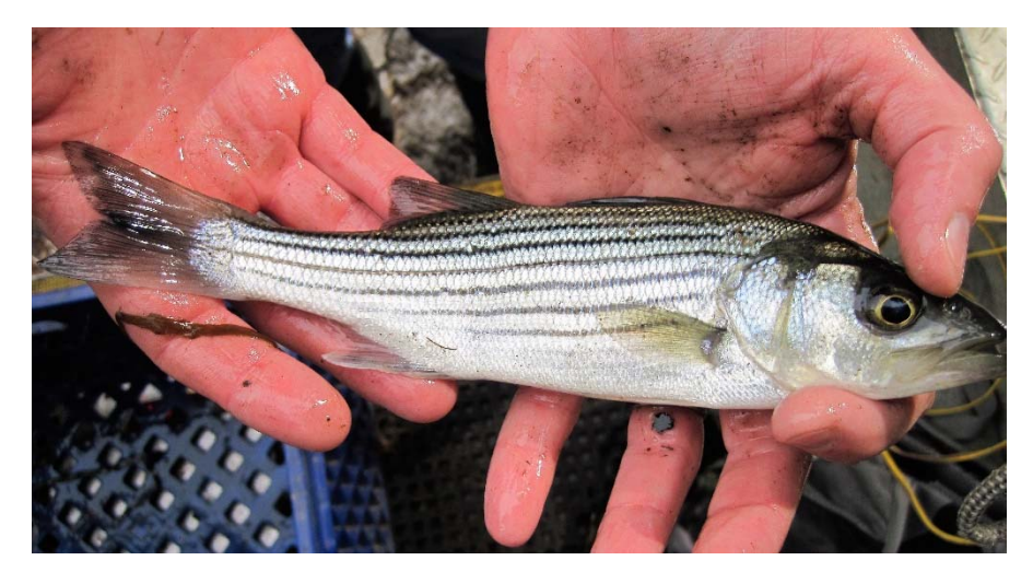
10-inch Striped Bass from Millstone River