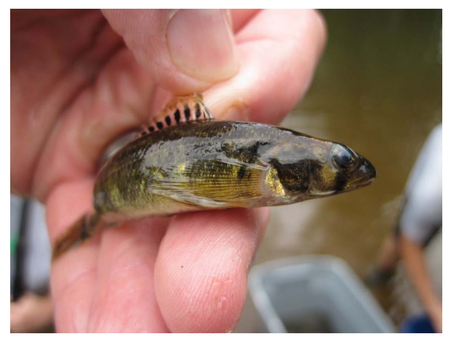
That's no Walleye! However it's in the same family... the Shield Darter, is an uncommon species potentially to be listed as a state Species of Special Concern