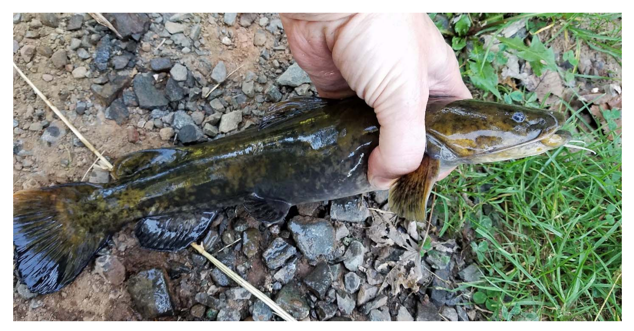
First Flathead Catfish documented upstream of former Weston Causeway Dam during fall of 2017 electrofishing survey on Millstone River.