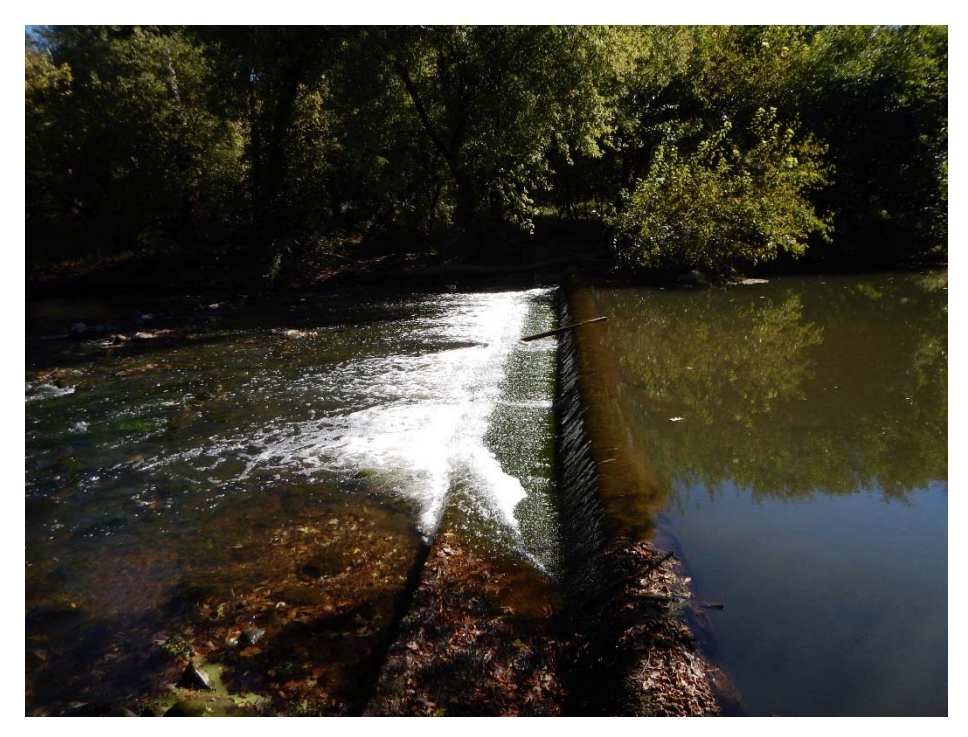
Blackwells Mills Dam, located approximately 4.5 miles upstream of former Weston Causeway Dam. Low flows conditions during fall of 2017