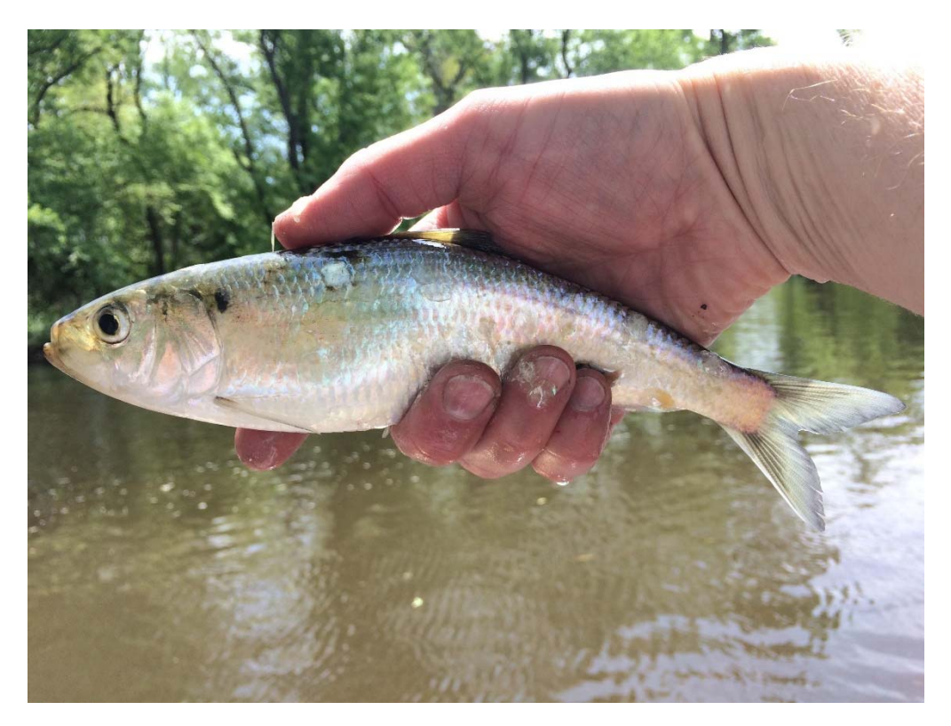
Confirmed Blueback Herring run in the Millstone River