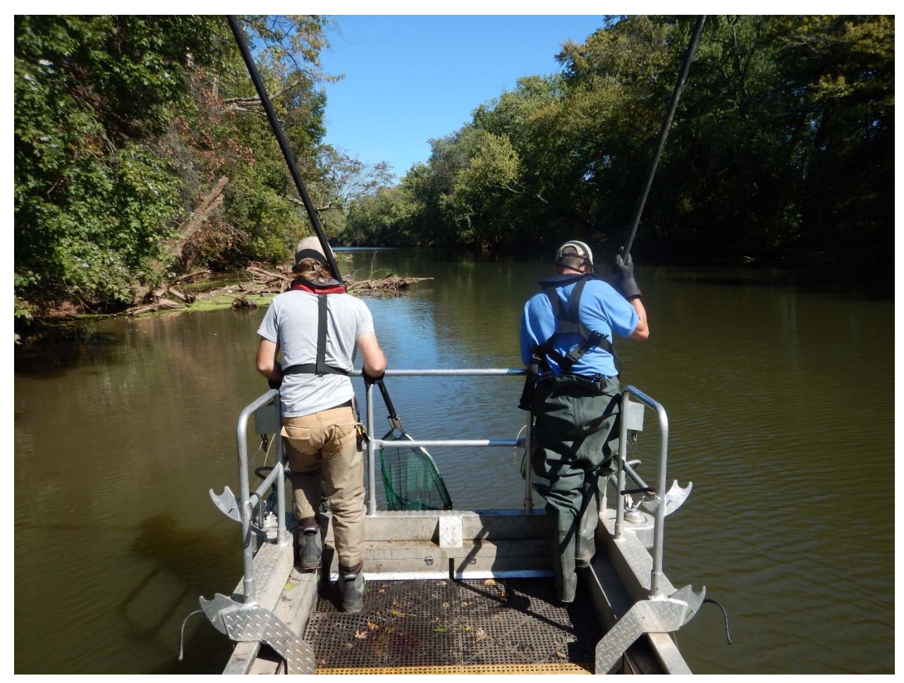
Captain's view... during boat electrofishing survey on the lower Millstone River, approximately ½ mile upstream from confluence with Raritan River.