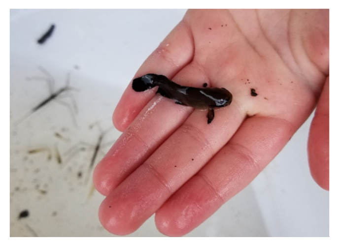
Young Brown Bullhead in hand (with aquatic insects known as Water Scorpions in background)