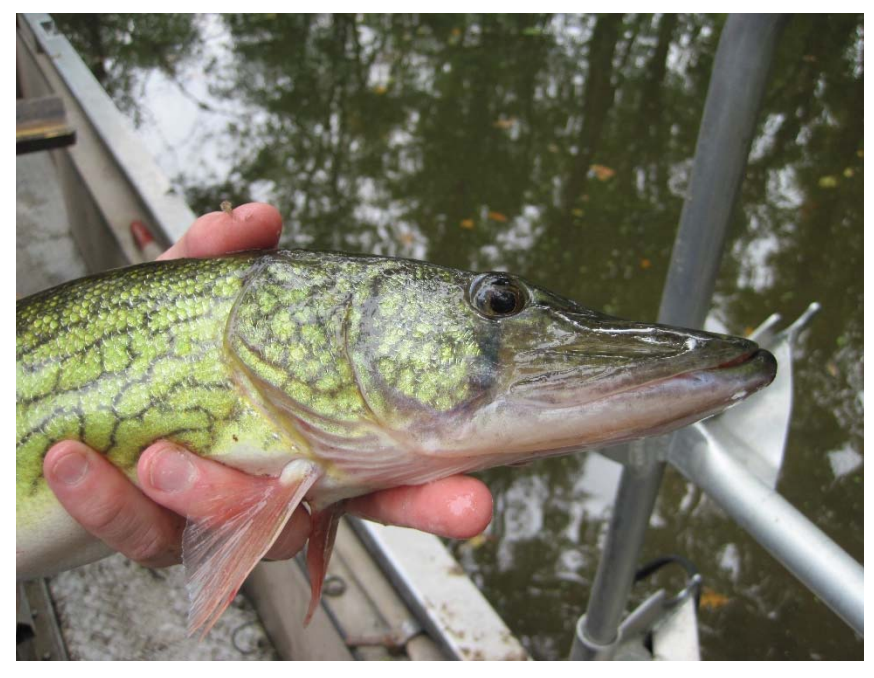
Heartv Millstone River Chain Pickerel