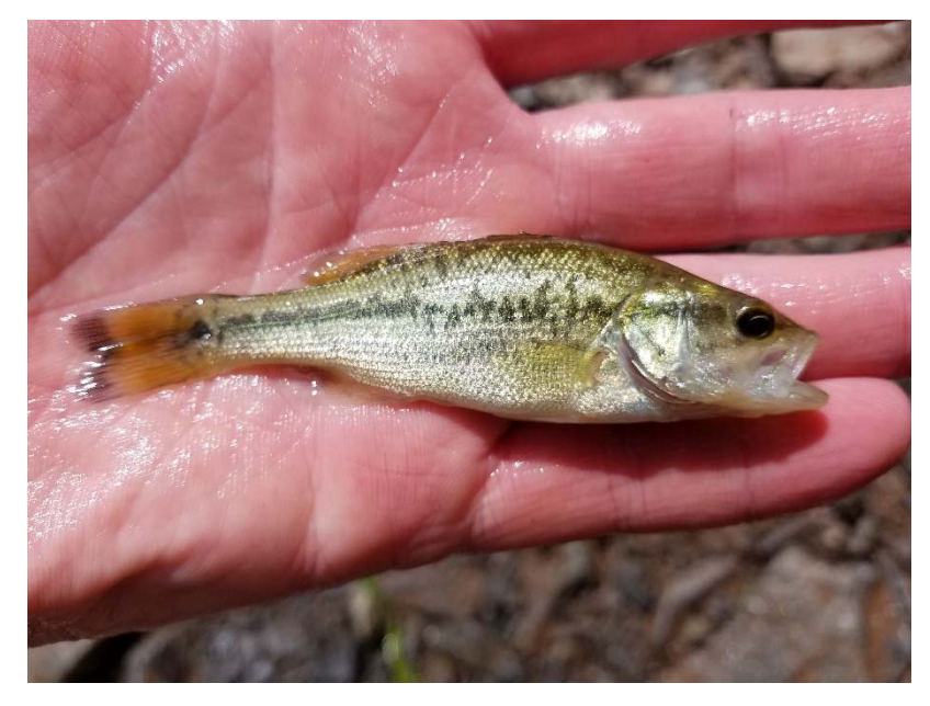
Yearling Largemouth Bass captured in Millstone River (captured August 2017 / born spring 2016)