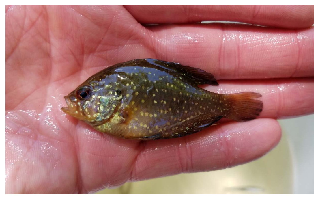
Native Bluespotted Sunfish encountered from Millstone River May 2018.