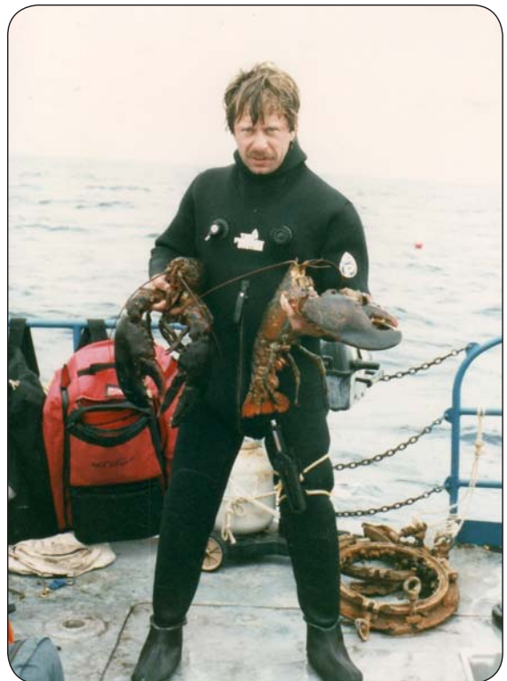
The author and his freshly caught dinner.