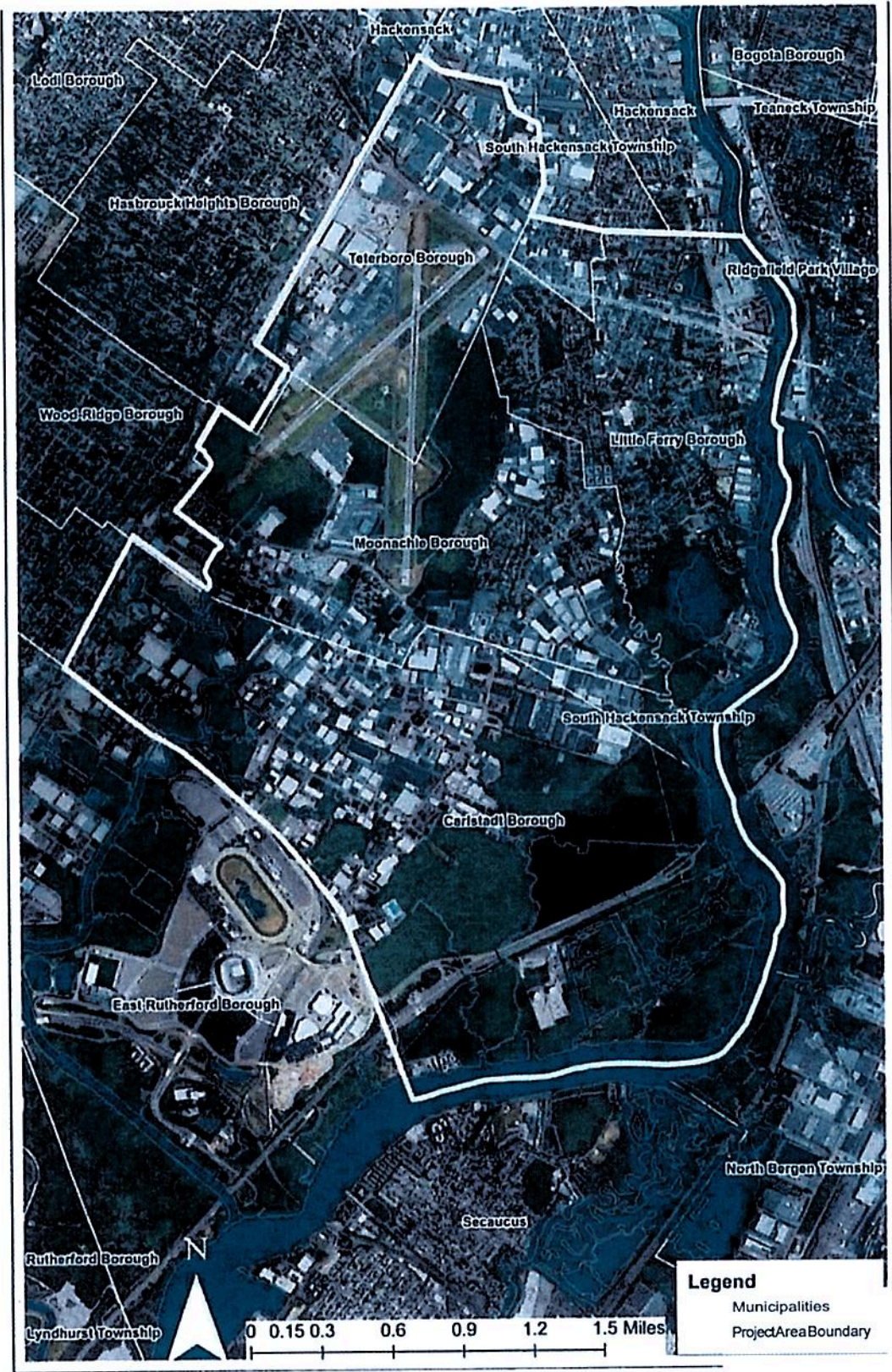
Figure 1. Rebuild by Design Meadowlands Flood Protection Project Area