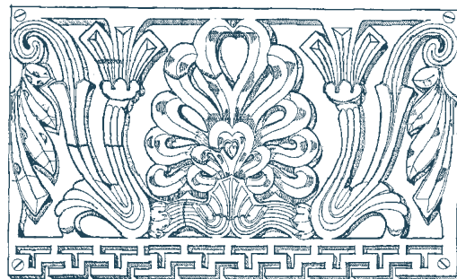
Detail of Cast Iron Grille, The Cornell House, Raritan, New Jersey