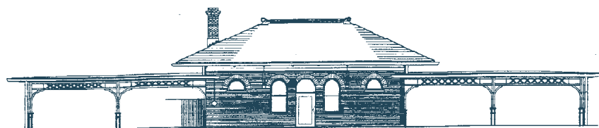
New Jersey Transit Station, Bradley Beach Borough, Monmouth County