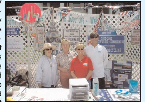
Dover Township Founder's Day

In May the Ocean County Recycles exhibit was at Ocean Fun Days , which was hosted by the NJ Marine Science Consortium at Island Beach State Park. The beautiful weather allowed visitors to enjoy all the activities and displays from organizations such as the American Littoral Society's Fish Tagging and Research Program, Barnegat Bay National Estuary Program, Ocean County Tourism, and many other environmental exhibitors. The US Coast Guard Auxiliary was also on hand for visitors to learn about boat safety. Visitors could also participate in eco and guided walking tours to learn about the coastal environment. Also in May, the Department of Solid Waste Management provided recycling information and giveaways made from recycled content at Ocean Township's Founder's Day.