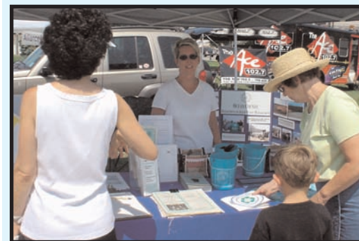
Fanta Sea Festival, Beach Haven