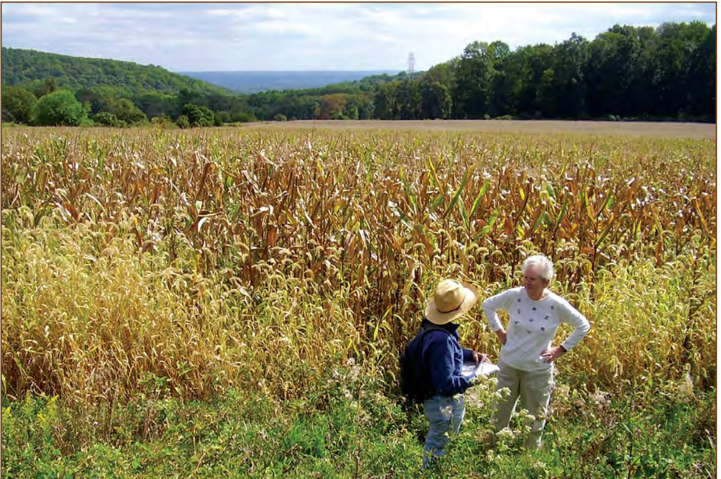
Sweet Hollow Preserve

The acquisitions represented additions to the Thomas F. Breden Preserve at Milford Bluffs and the Crossley, Great Piece Meadows, Moorestown and Sweet Hollow preserves.