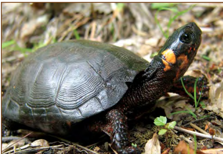
Bog Turtle.

The Trust's strategic attempt to leverage federal funding comes at a time when the economic downturn and lower real estate values provide opportunity to preserve open space but while Garden State Preservation Trust funding for open space preservation is greatly diminished. The US Fish & Wildlife Service has not announced when it will make its grant awards.