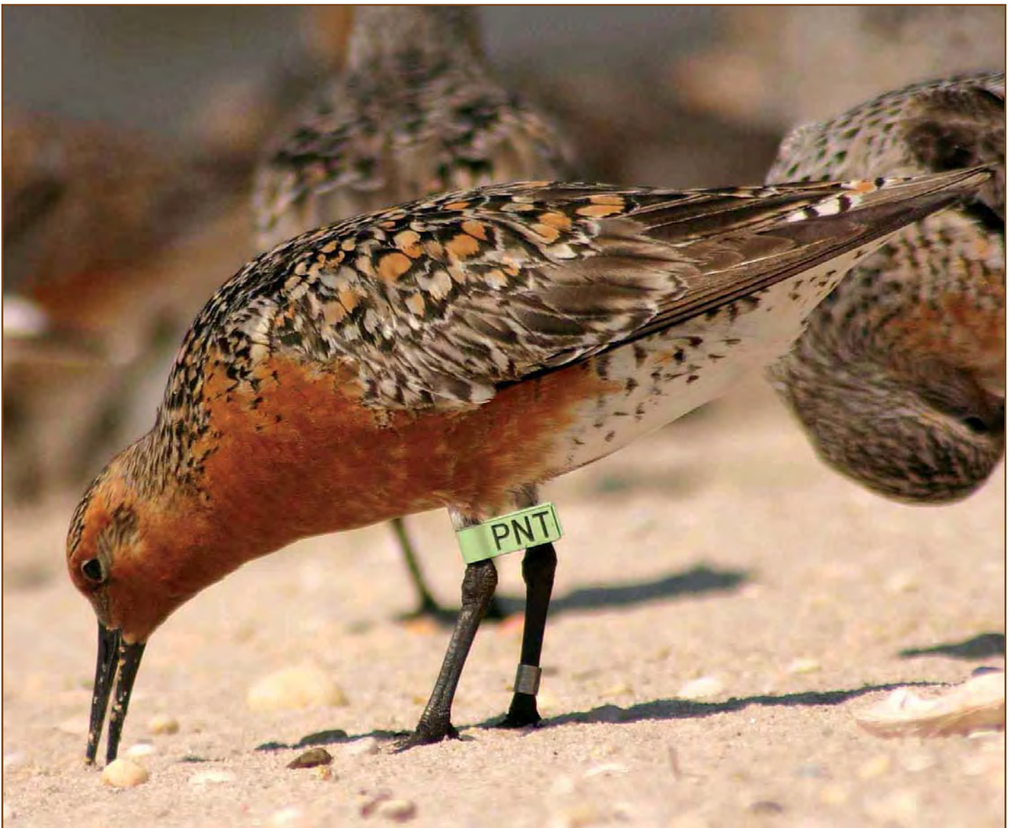
Red Knot. Photo Courtesy of Mark Peck of the Royal Ontario Museum, Toronto, Ontario, Canada, May 2008

In the mid-1990's, the horseshoe crab harvest increased dramatically and shorebird numbers began to decline. This spurred the current work of the Delaware Bay Shorebird Project funded by the Trust--intensive studies to understand if decline of horseshoe crabs and their eggs were impacting migratory shorebirds. In the ensuing 12 years, biologists not only documented precipitous declines in shorebird numbers but, more alarmingly, elucidated the cause: an increasing proportion of shorebirds, particularly the red knot, were not gaining sufficient weight to complete migration and successfully reproduce. Sufficient weight gain on Delaware Bay, the last stop before birds reach the Arctic, is necessary for survival and successful reproduction.