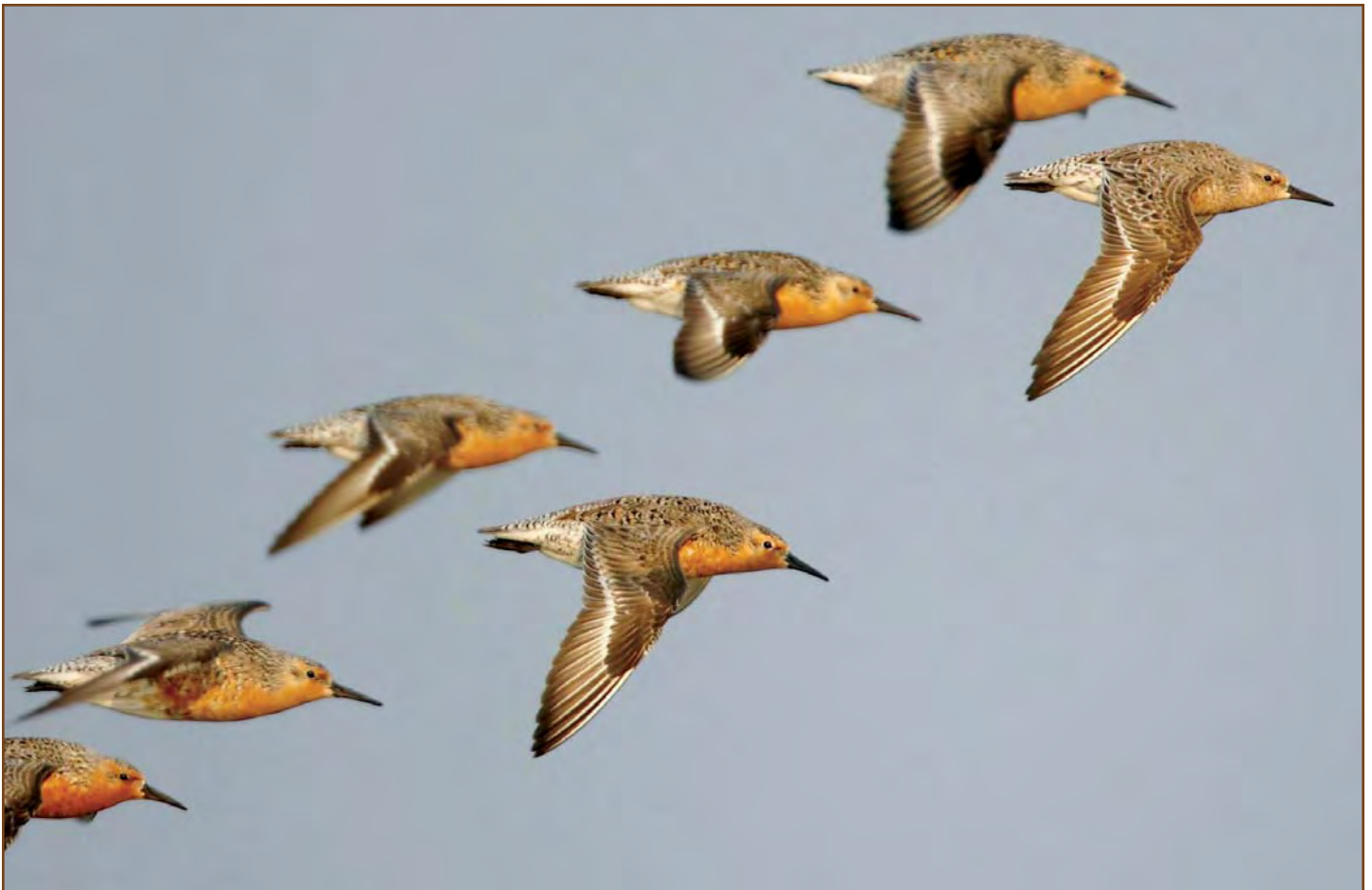
Red Knots in Flight. Photo Courtesy of Mark Peck of the Royal Ontario Museum, Toronto, Ontario, Canada, May 2008

In 1986, ENSP began aerial surveys to document numbers of migratory shorebirds on Delaware Bay. By 1990, in partnership with most of the state's conservation groups, ENSP and the Trust developed a comprehensive management plan for migratory shorebirds that was soon incorporated into state and national planning for shorebird protection. In 1986, Delaware Bay became the first Site of Hemispheric Importance designated under the Western Hemisphere Shorebird Reserve Network (WHSRN). There are now over