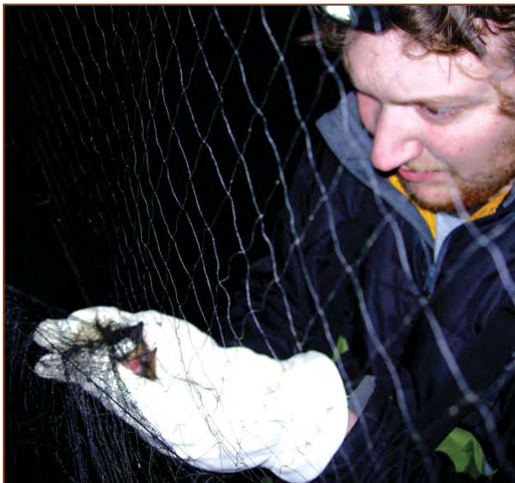
Monitoring with Mist Nets.

The Morristown Airport is required to operate the airport in compliance with the safety standards established by the Federal Aviation Administration (FAA), such as requirements that critical areas surrounding and extending beyond the ends of the runways are free of obstructions that could interfere with the approach, landing or taking-off of aircraft.