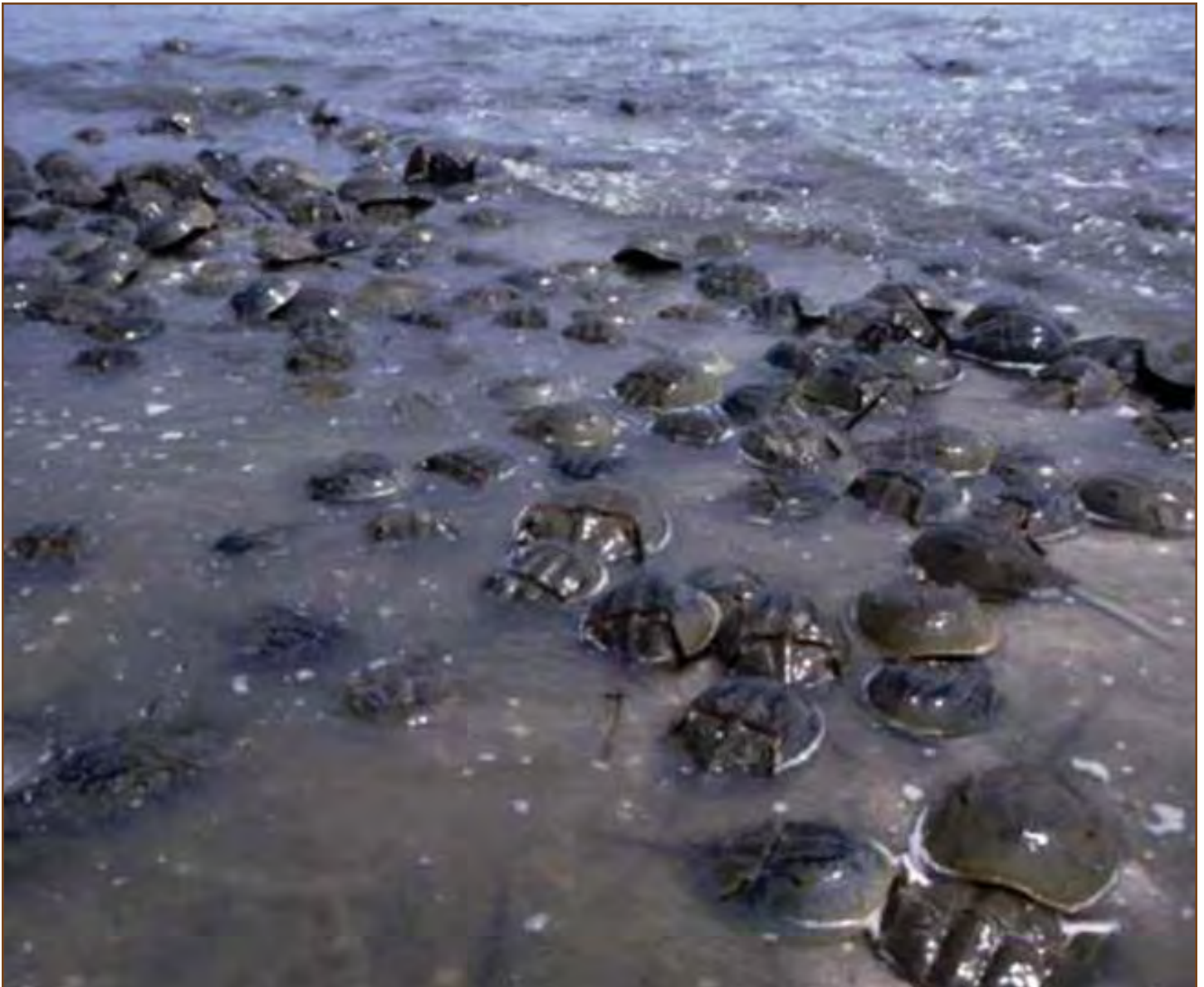
Spawning Horseshoe Crabs.

and New Zealand synthesized all published and unpublished information on red knot for consideration for federal listing under the Endangered Species Act. This document was published in 2008 as a monograph entitled "Status of the Red Knot in the Western Hemisphere." The monograph, the latest in the Studies in Avian Biology series published by the Cooper Ornithological Society, received US and worldwide distribution. Information from this report was instrumental to Governor Jon S. Corzine, the NJ Legislature, and state conservation groups, who in 2008 lead the Atlantic coast states in shorebird conservation by imposing an indefinite ban on horseshoe crab harvest until the red knot population recovers. This and other published works were only possible through the support from the Trust.