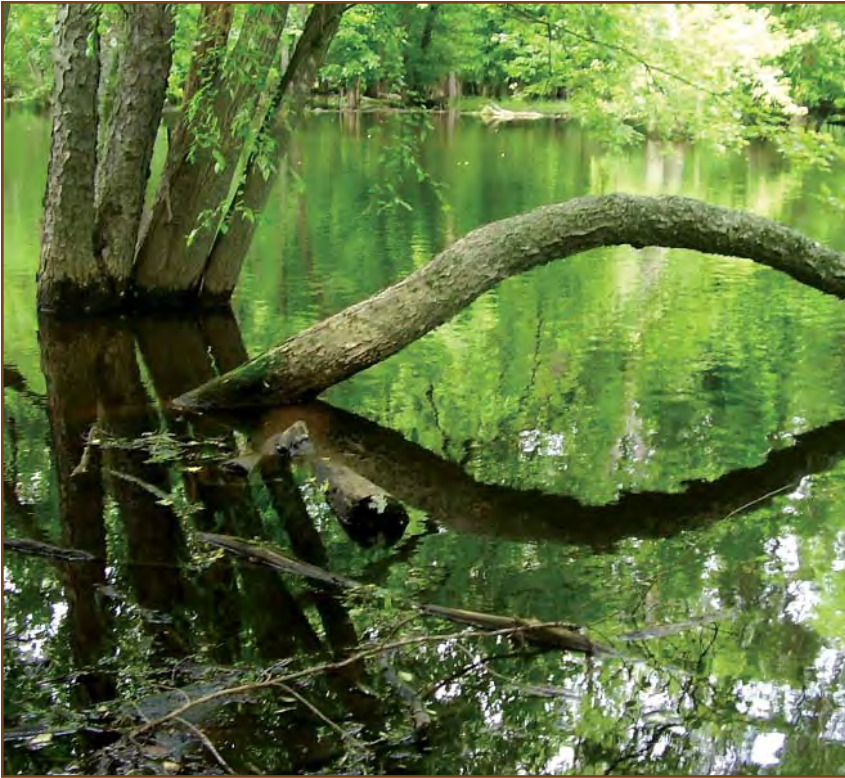
Great Piece Meadows Preserve