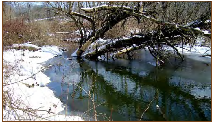
Armstrong Bog property

This summer the United States Fish & Wildlife Service announced the availability of federal grant money under Section 6 of the Endangered Species Act for land acquisition