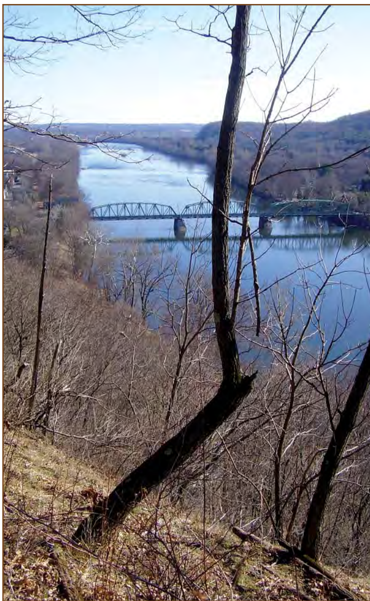
River view from Thomas F. Breden Preserve at Milford Bluffs