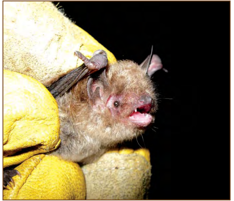
Indiana Bat.

Specifically, the FAA imposes standards regarding the height of obstructions, including trees, in the vicinity of the ends of airport runways and requires obstructions that exceed their standards to be removed. Built in that late 1950's, trees within the Morristown Airport flight path have now grown so tall that they exceed the standards and need to be removed.