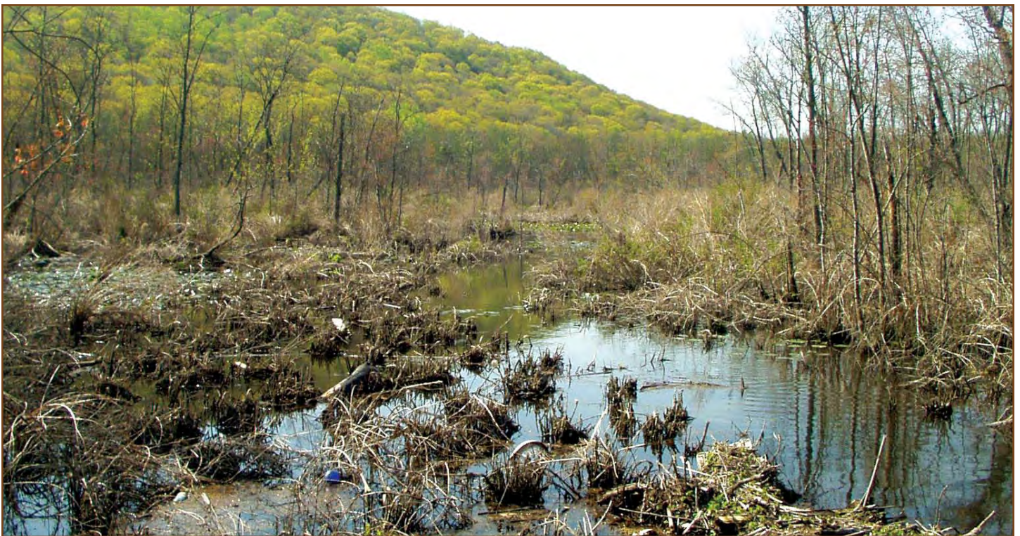
Mountain Lake Bog Preserve

Parks & Forestry presently has very limited resources, given the relative small size of the nine preserves being transferred and their geographical proximity to large Parks & Forestry holdings, they should not pose much, if any, additional management burden to the agency. The Trust expects to propose a similar swap of management responsibility between it and the Division of Fish & Wildlife in the future. As it did prior to proposing the swap with Parks & Forestry, the Trust will consider a property's ecological significance and, in most cases, where the property is ecologically significant, management responsibility will not be transferred from the Trust.