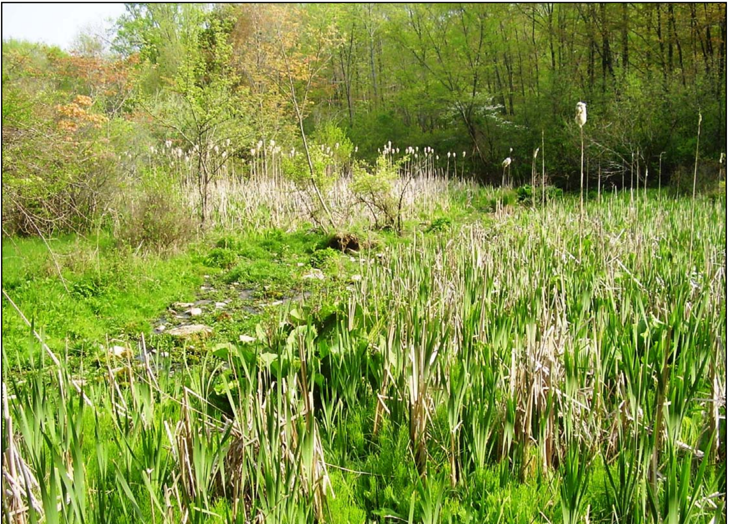
Mt. Rascal Preserve

Since pre-colonial settlement, Mt. Rascal has seen much change in the landscape. Early maps of Independence Township, dating back to 1874, identify this site as the Morris H. Weise property. The old single-story stone structure reveals architectural clues to its possible first German settlers. In recent decades, the DiMaio family lived and was raised in this small stone house. In the 1930s the family,