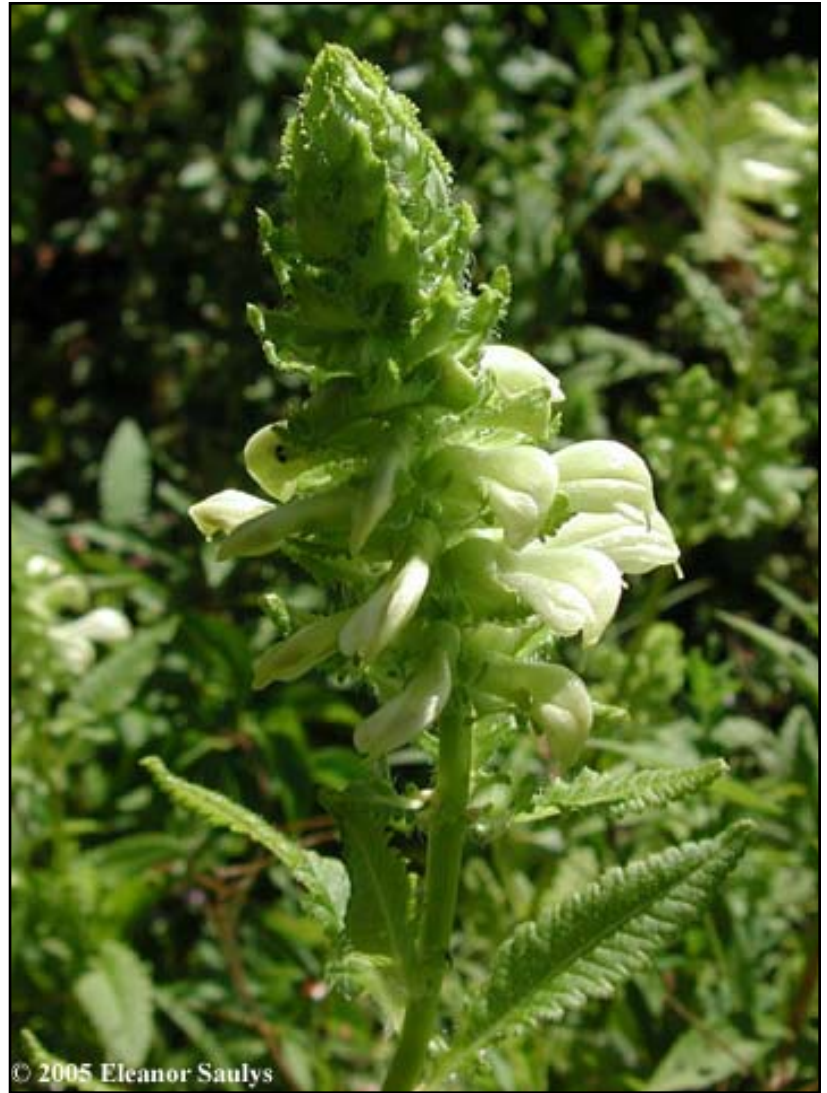
Swamp lousewort at Mt. Rascal Preserve

Now living in nearby Hackettstown, two members of the DiMaio family, brothers Jerry and Al, continue to visit the old farm. They have helped to post the property and work with the Trust to see that it is kept clean of garbage and trash. "It's a nice place to return to, to watch nature and enjoy a nice fall day," said Al DiMaio. The Trust has established a small parking area at the old homesite where visitors can set out on explorations, although formal trails are not yet established at this time. Hikers can travel beside ruins of old stone walls that line many of the unmarked woods roads.