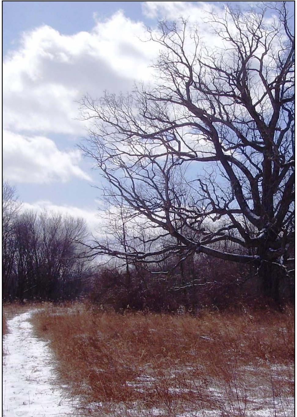
Armstrong Bog Preserve

eral and state fish and wildlife agencies will be monitoring and managing the bog turtle population on the property, including threats to bog turtle habitat. Emergent wetlands, important to bog turtles, have become degraded by invasive plant species such as purple loosestrife, reed canary grass and common reed. Furthermore, once extensive emergent wetlands of sedges, sphagnum and cattail have succeeded into shrub/shrub wetlands, which are considered less suitable for bog turtles. Management techniques to control invasive plant species and restore the emergent wetland habitat should greatly enhance bog and wood turtle habitat.