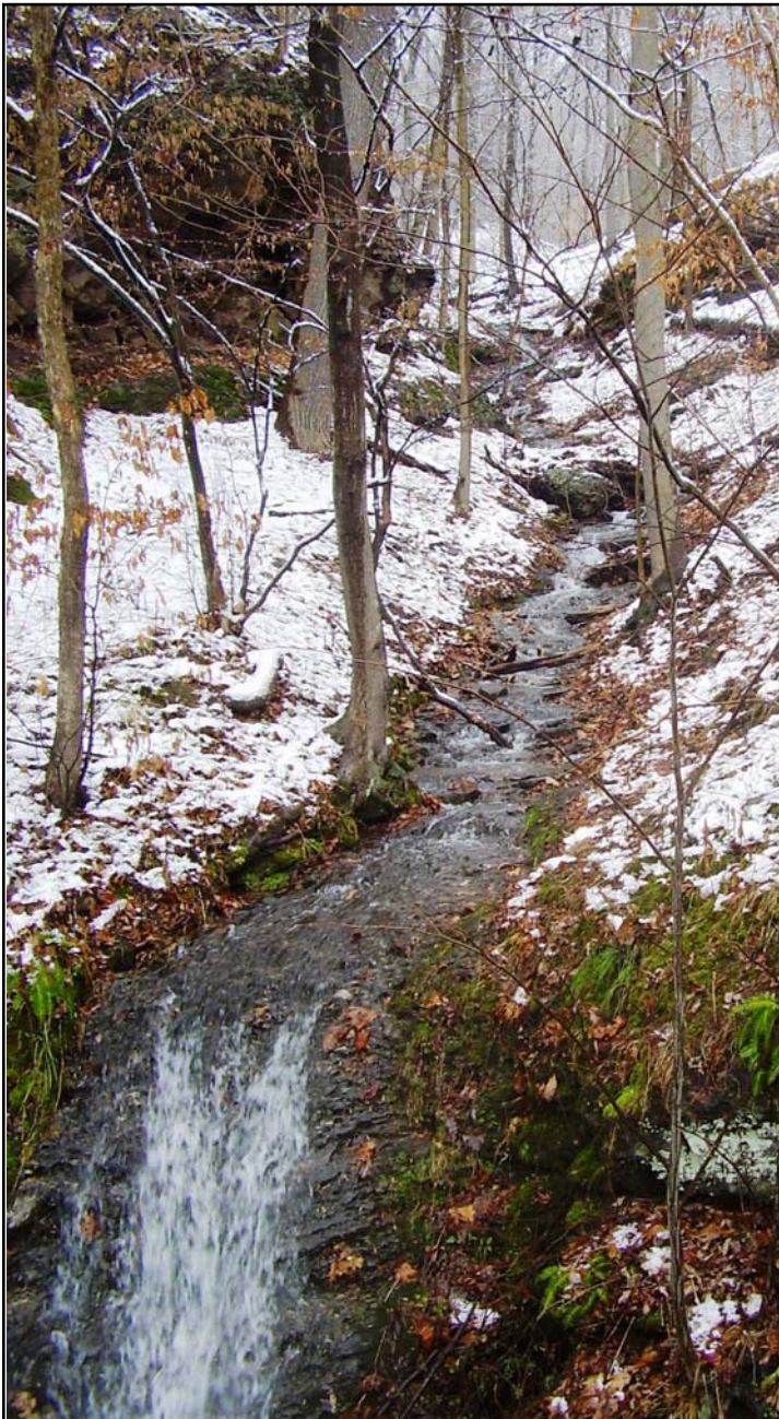
Waterfall at Gravel Hill Preserve

T hat seed which falls on the gravelly land does sometimes grow. With some proper care and nurturing it can grow quite well. The seed represents the wonderful growth of the Trust's Gravel Hill Preserve which overlooks the Delaware River in Holland Township, Hunterdon County. A unique and aptly-named mountain, the thin soils of Gravel Hill have for millennia supported an intact, mixed hardwood forest of white oak, red oak, black birch and black cherry. The fist-size chunks of whitish quartz-like rock are easily seen where fallen leaves have rotted or blown away.