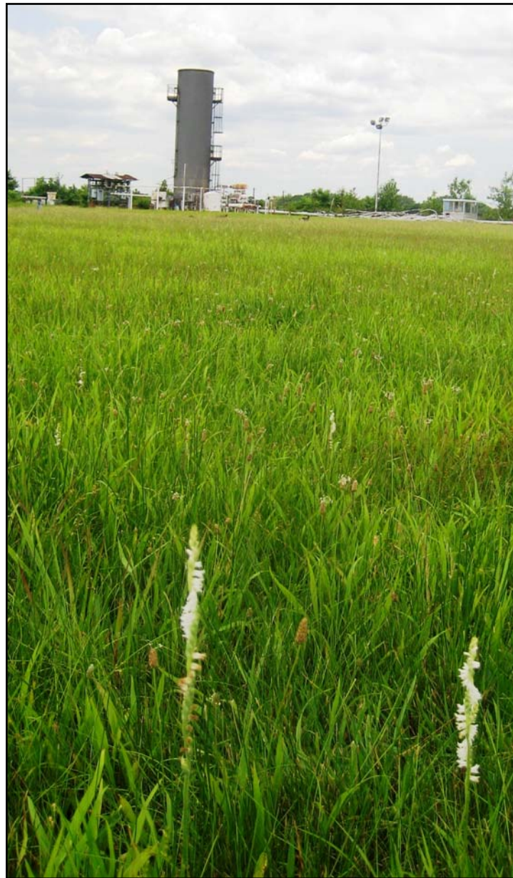
Field of spring ladies' tresses on Petty's Island

Over 500 acres in total, the more than 350-acre island is surrounded by some 150 acres of ecologically important tidal flats. Given its location in a heavily industrialized area, surprisingly the island provides breeding, foraging or resting habitat for a dazzling array of wildlife. In addition to a pair of American bald eagles that currently use Petty’s Island as part of its foraging territory, hawks, falcons and waterfowl such as osprey, Northern harrier, Cooper’s hawk, red-shoul-