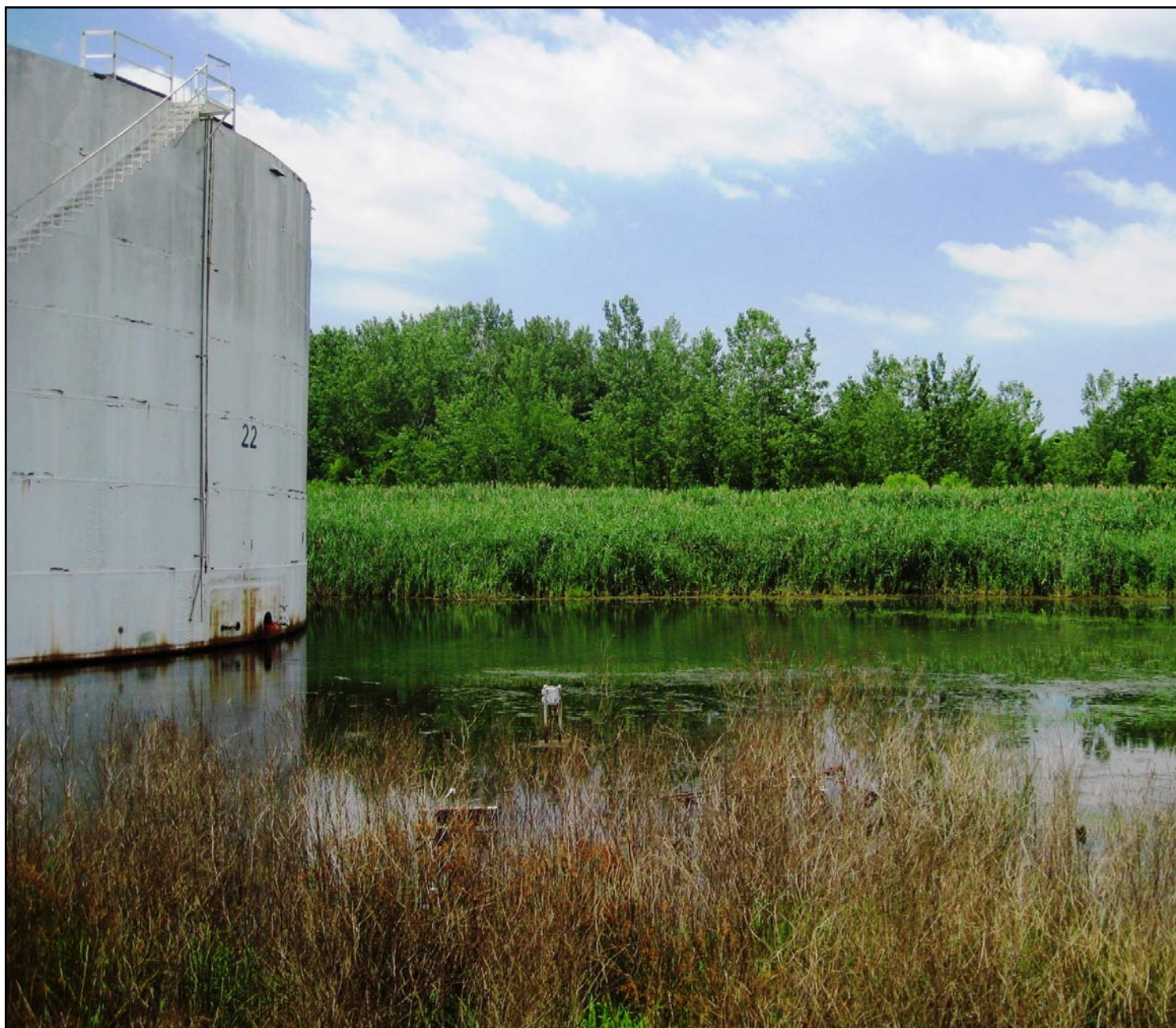
CITGO oil tank sitting in a detention area that may succeed to wetlands habitat

Once fully restored, Petty’s Island will provide amazing opportunities to learn about its natural diversity and fascinating history. Its restoration will provide local residents with access to spectacular views of the river and the City of Philadelphia that