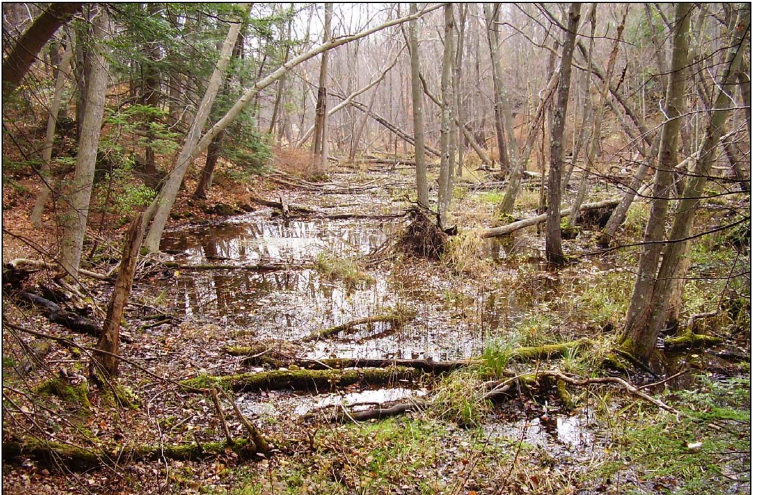
First Time Fen Preserve

This first-preserved property within First Time Fen was acquired by Green Township, with the assistance of The Land Conservancy of New Jersey, on behalf of the State of New Jersey and the Trust. Preserving this property is also the first step in Green Township's planned greenway to link the Whittingham Wildlife Management Area to the Pequest River. The property consists of an upland mixed hardwood forest with many areas of steep dolomite rock outcrops as well as an area of low-lying forested swamp edged in part with small groves of northern hemlock along the slopes and ravine. The yellow water buttercup occurs on this property. The property also provides important habitat for animals including wood turtle, black bear, turkey and songbirds. A maze of old logging roads zigzag across the property providing access for hiking, although dense areas of the prickly invasive plant Japanese barberry pose a challenge. The Trust, The Land Conservancy and Green Township hope to partner on habitat stewardship projects to tackle this and other invasive species.