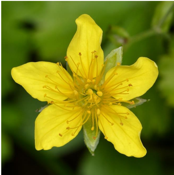
Barren Strawberry Flower

Barren-strawberry is the common name for the imperiled New Jersey plant species Waldsteinia fragarioides var. fragarioides . The leaves of this species bear strong resemblance to the common strawberry Fragaria virginiana , which lends itself to Waldsteinia's descriptive name " fragarioides " (strawberry-like). The term "barren" refers to the fact that plant does not bear a sweet fruit like its namesake. There are some discrepancies among taxonomists regarding variants of the botanical name (further discussion on the topic can be found in the section 'Synonyms'). For clarity and brevity throughout this abstract the species will be referred to by either the full Latin name as listed on the New Jersey Rare Plants List: Waldsteinia fragarioides var. fragarioides (NJ NHP 2010), W. fragarioides , or simply as Barren-strawberry.