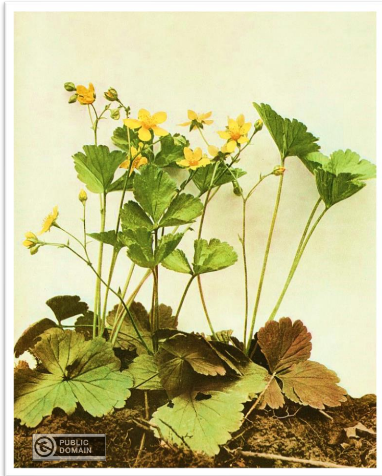
Barren Strawberry