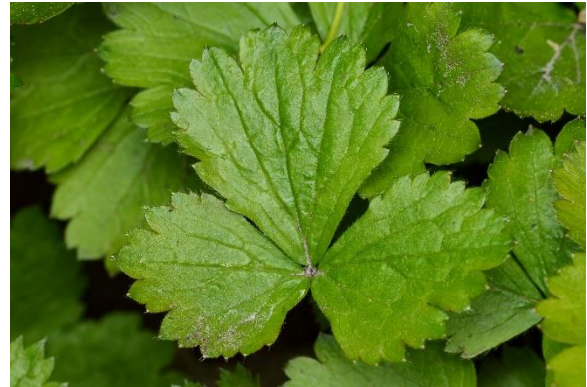
Barren Strawberry Leaf