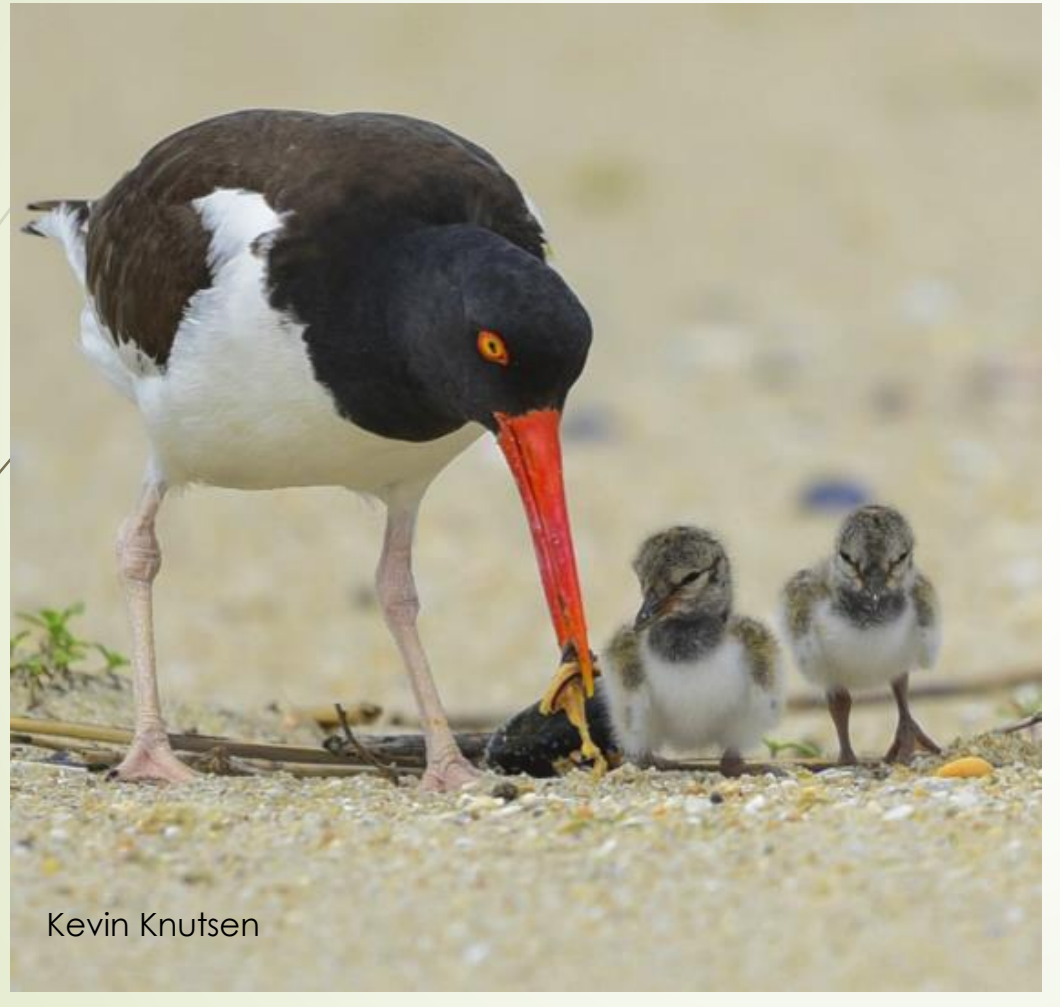
American Oystercatcher Haematopus palliatus