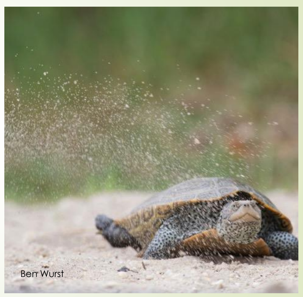
Diamondback Terrapin Malaclemys terrapin