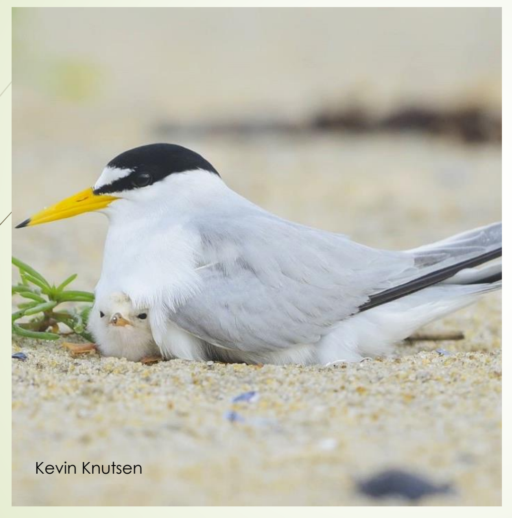
Least Tern Sternula antillarum