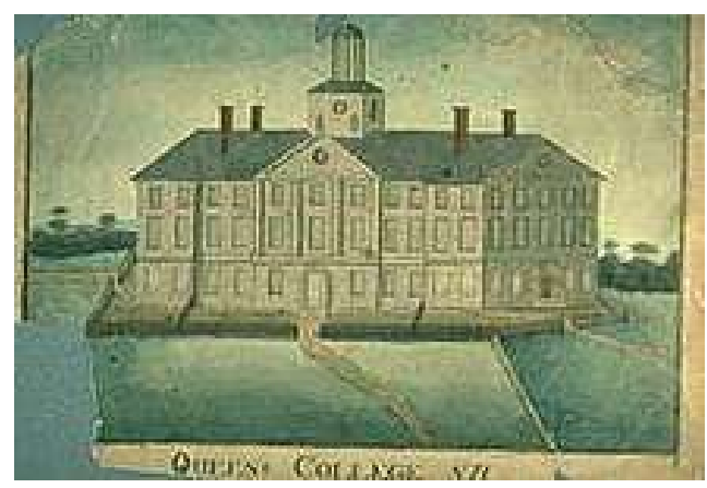
Queen's College, today Old Queens, was constructed from 1809 to 1825.

Legislature of New Jersey authorized the new name Rutgers College. Col. Rutgers the next year in 1826 made a gift of $200 to purchase a bell for the new college building which remains in the cupola of Old Queens at Rutgers – New Brunswick's College Avenue campus today and dedicated the interest on a $5,000 bond to Rutgers College.