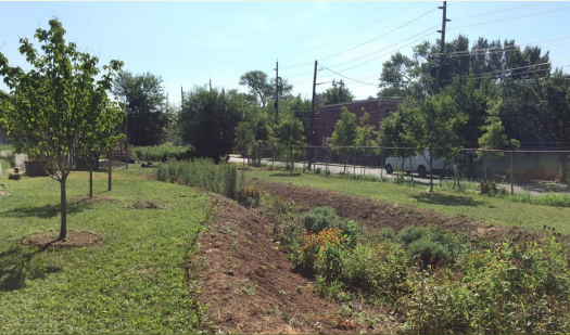
New Jersey Tree Foundation. Camden Urban

Treed communities have a reduced level of domestic violence and foster safer, more sociable neighborhood environments.