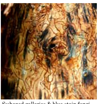
S-shaped galleries & blue stain fungi

SPB attacks all pine species including pitch, shortleaf, loblolly, and Virginia, preferring trees weakened from drought, stress, or injury. The tree crown displays the first outward sign of infestation when it rapidly turns from a healthy green to yellow, red, and finally, brown. A closer inspection may reveal pitch tubes on the trunk and S-shaped galleries under the bark. The beetle also transmits blue stain fungi, which stops water from circulating in the tree.