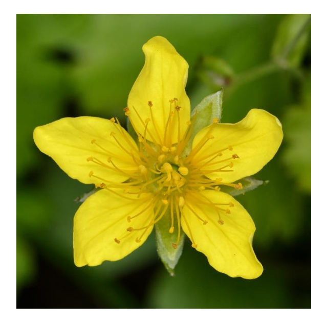
Barren Strawberry Flower by Ryan Hodnett (CC BY-SA)

Barren-strawberry is the common name for the imperiled New Jersey plant species Waldsteinia fragarioides var. fragarioides. The leaves of this species bear strong resemblance to the common strawberry Fragaria virginiana, which lends itself to Waldsteinia's descriptive name "fragarioides" (strawberry-like). The term "barren" refers to the fact that plant does not bear a sweet fruit like its namesake. There are some discrepancies among taxonomists regarding variants of the botanical name (further discussion on the topic can be found in the section 'Synonyms'). For clarity and brevity throughout this abstract the species will be referred to by either the full Latin name as listed on the New Jersey Rare Plants List: Waldsteinia fragarioides var. fragarioides (NJ NHP 2010), W. fragarioides , or simply as Barren-strawberry.