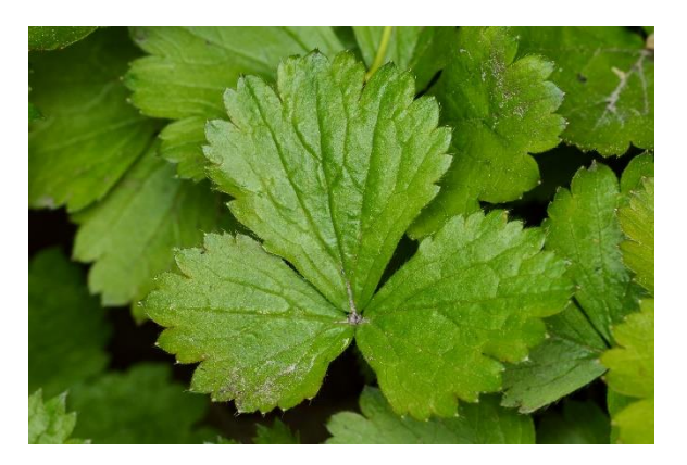
Barren Strawberry Leaf