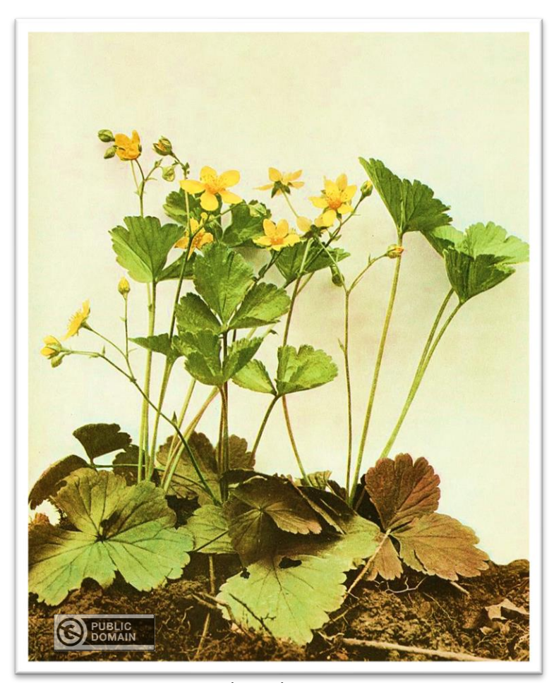
Barren Strawberry