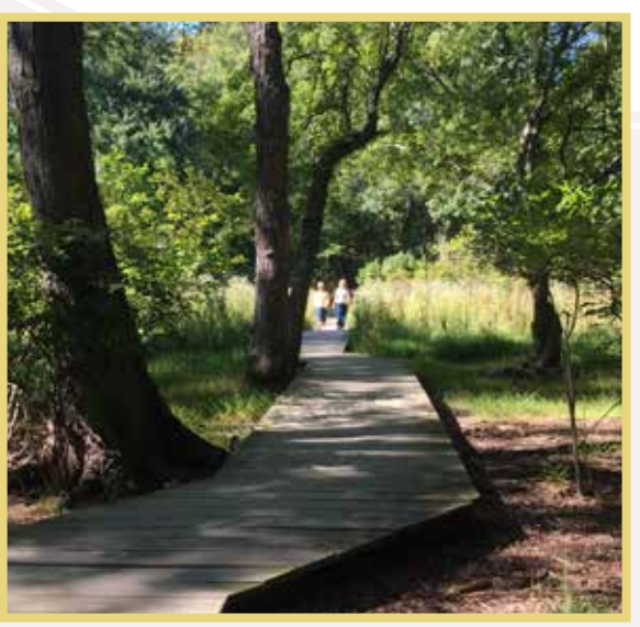
This brochure was funded by the Federal Highway Administration's Recreational Trails Program through the New Jersey Department of Environmental Protection.

The White Trail explores wetlands, forests and fields and provides a great variety of wildlife viewing opportunities. Soon after beginning, the trail passes a freshwater swamp ringed by red maples. The path rises and overlooks a small ravine and parallels the Garden State Parkway. Further along, as it passes into Booth Field, visitors may want to take a moment to visit the butterfly garden and enjoy the colorful insects. Though many species will visit the garden between spring and fall, the striking black and orange monarch is one of the most popular. After leaving the field, the White Trail continues its winding path through the forest, skirting Cheesequake's boundary.