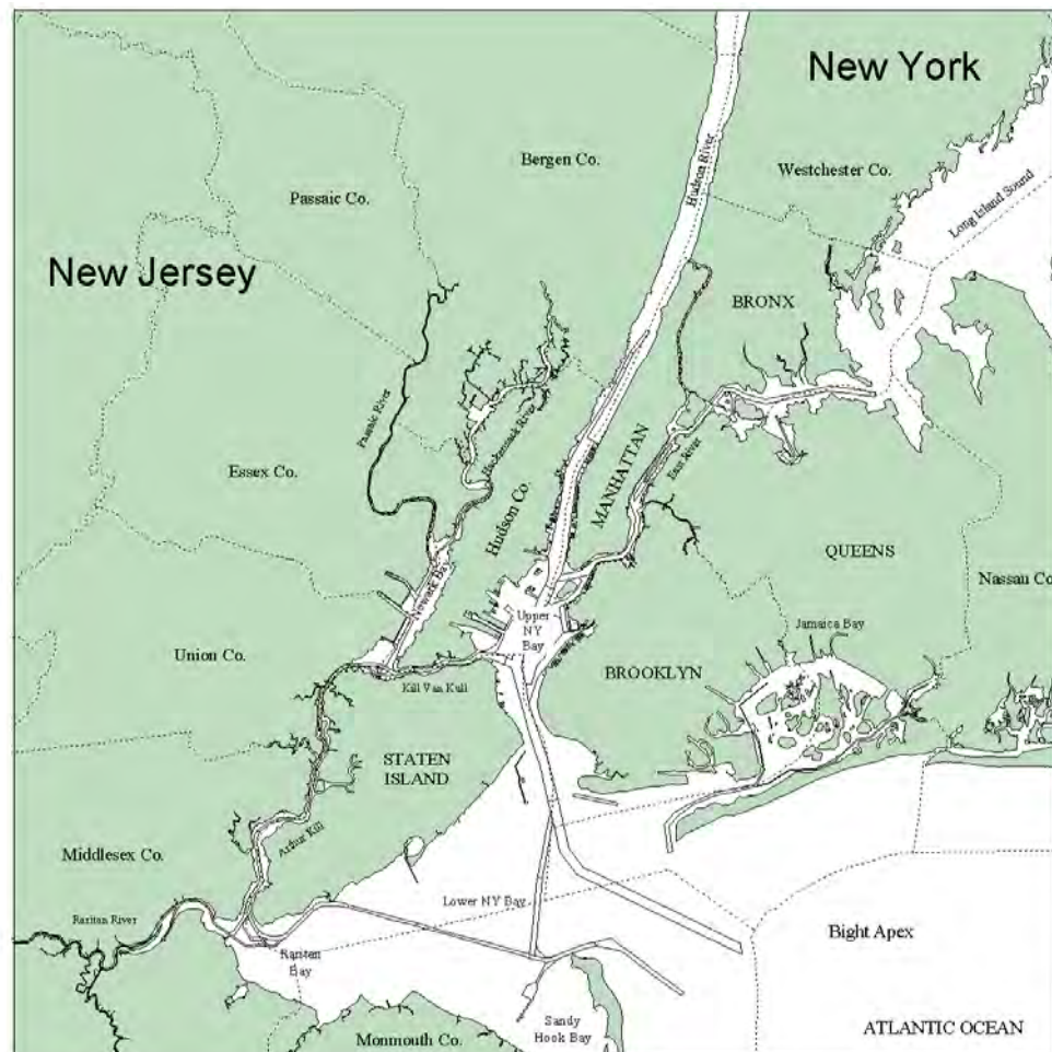
Figure 1 - 1: Port of New York & New Jersey

Just as the economic goal is to maximize and expand the use of the Port, the environmental goal is to maintain and enhance the estuary in which the Port is located (see Figure 1 – 1). This gives this DMMP a dual goal that profoundly affects the evaluation and selection of dredged material management options for the Recommended Plan that is presented in this report.