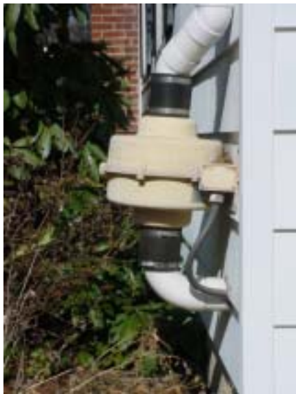
A subsurface depressurization system fan on the outside of a building.

An effective method to prevent vapor intrusion during the cleanup process is to install subsurface depressurization systems at the affected buildings. The two most common types are the sub-slab depressurization system and the sub-membrane depressurization system .