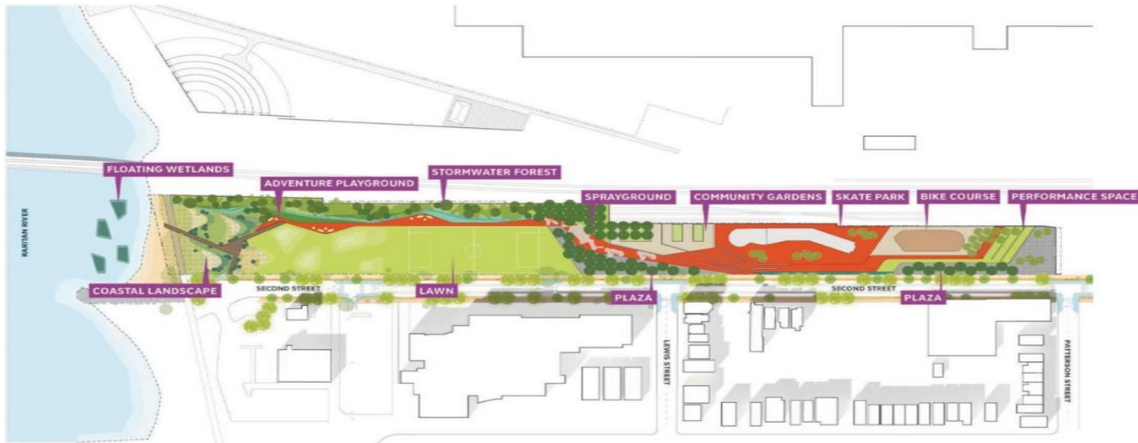
2 nd St Park, Perth Amboy