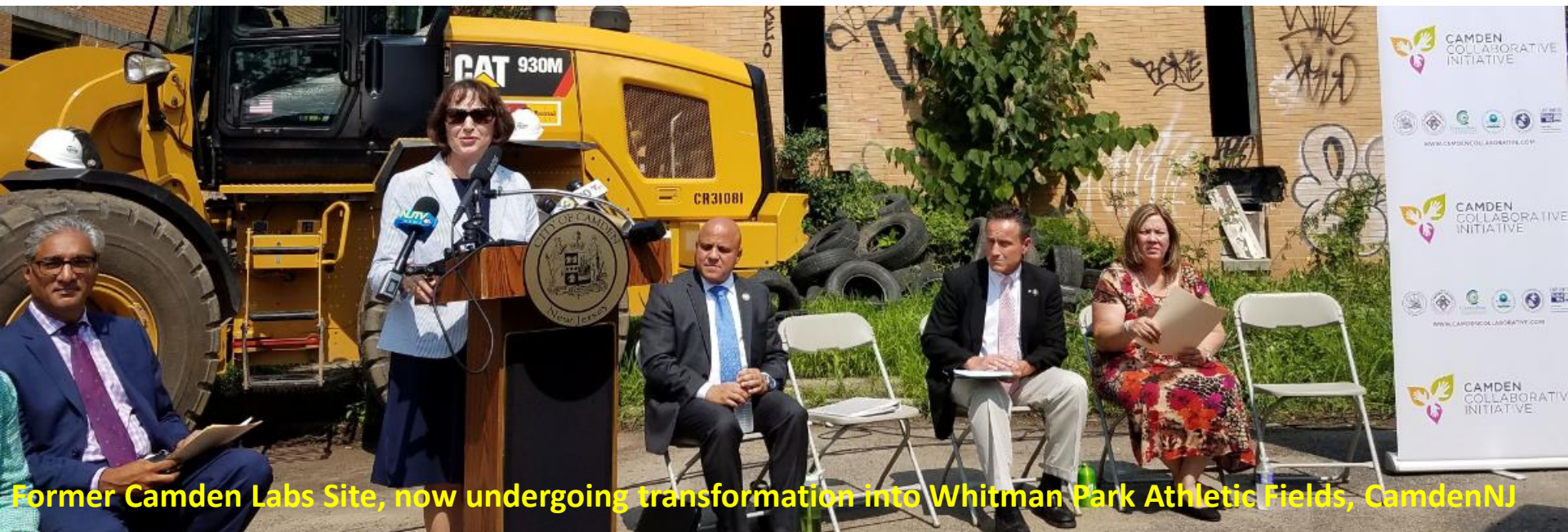
Former Camden Labs Site, now undergoing transformation into Whitman Park Athletic Fields, CamdenNJ