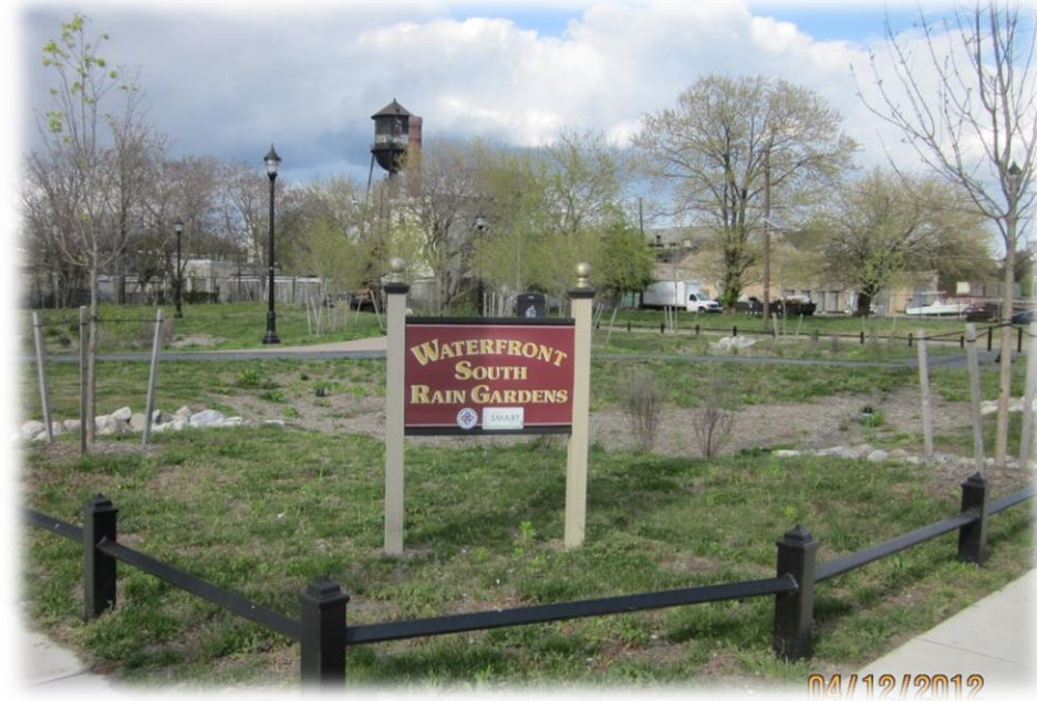
Waterfront South Rain Gardens Park, Camden NJ