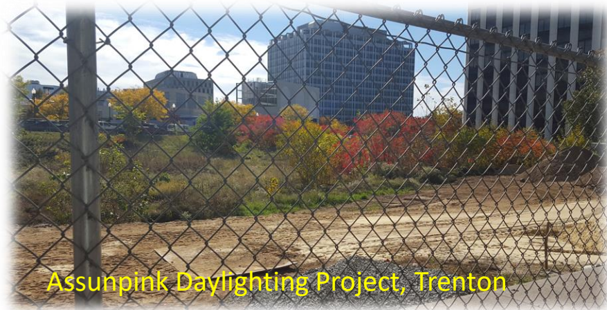
Assunpink Daylighting Project, Trenton