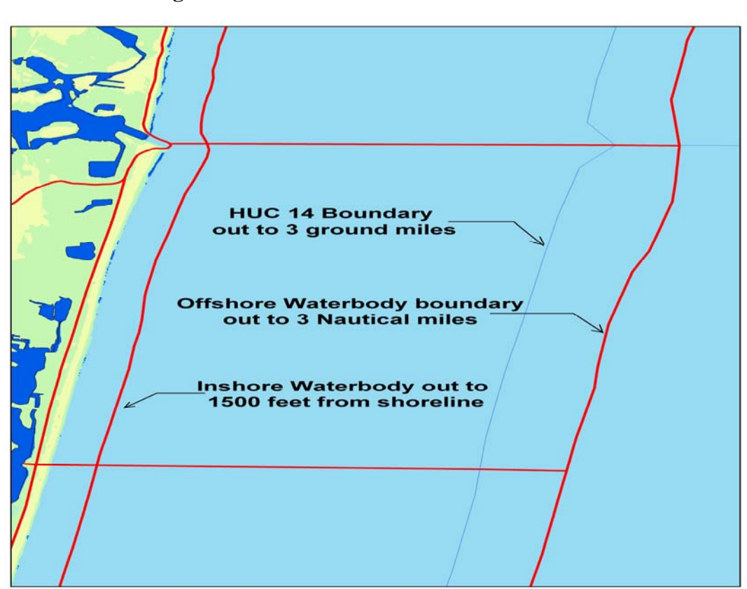
Figure 3.1a Offshore HUC Extensions