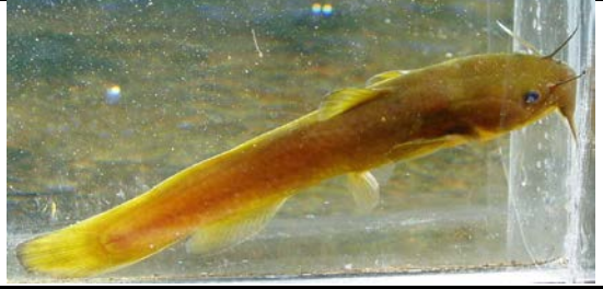
Margined Madtom Noturus insignis