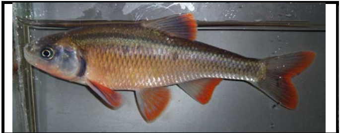
Common Shiner Luxilus cornutus