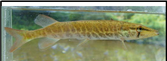
Redfin Pickerel Esox americanus americanus