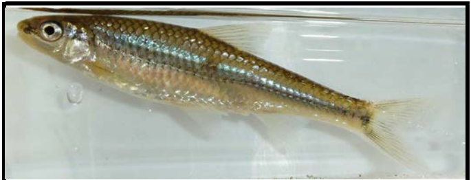
Spottail Shiner Notropis hudsonius