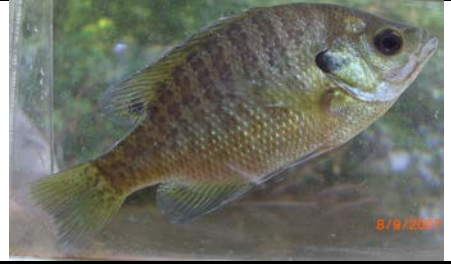
Bluegill Lepomis macrochirus