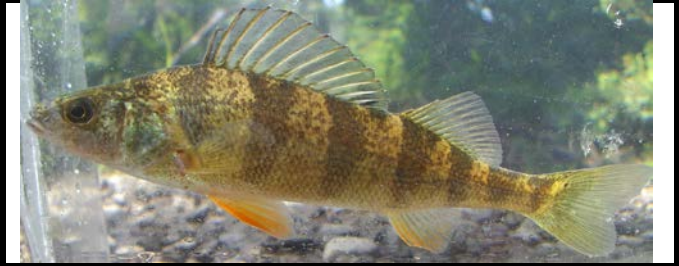
Yellow Perch Perca flavescens