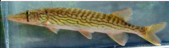
Chain Pickerel Esox niger