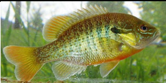
Redbreast Sunfish Lepomis auritus