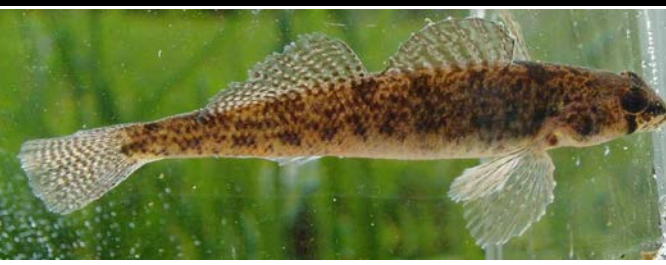
Tessellated Darter Etheostoma olmstedii