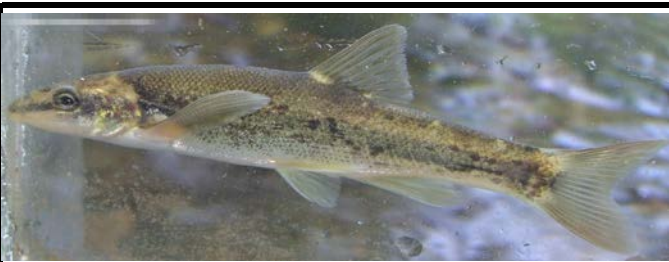
Longnose Dace Rhinichthys cataractae