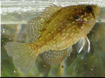
Bluespotted Sunfish Enneacanthus gloriosus