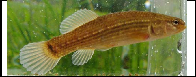
Eastern Mudminnow Umbra pygmaea