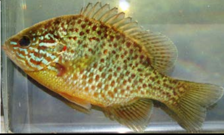
Pumpkinseed Lepomis gibbosus