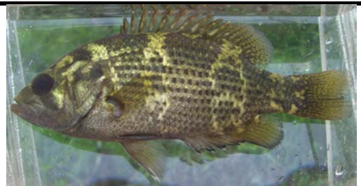
Rockbass Ambloplites rupestris