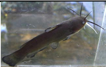
Yellow Bullhead Ameiurus natalis