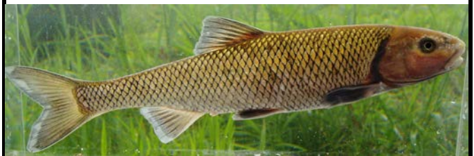
Fallfish Semotilus corporalis