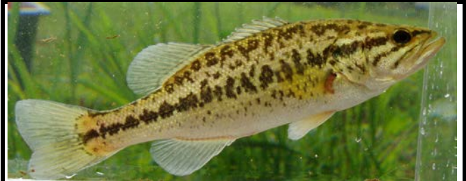
Largemouth Bass Micropterus salmoides