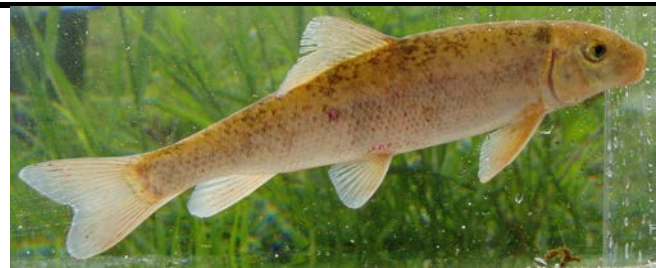
White Sucker Catostomus commersoni