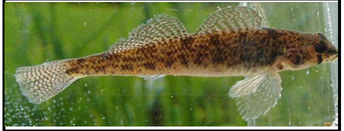
Tessellated Darter Etheostoma olmstedii