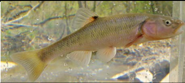
Creek Chub Semotilus atromaculatus