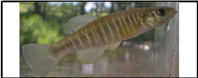
Banded Killifish Fundulus diaphanus