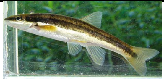
Blacknose Dace Rhinichthys atratulus