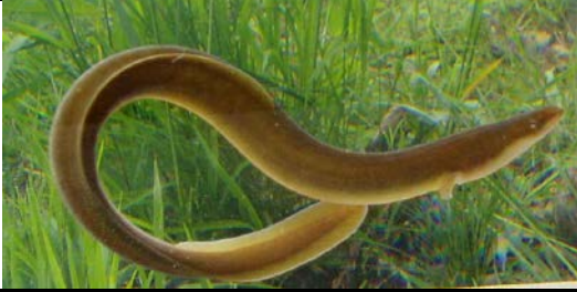
American Eel Anguilla rostrata