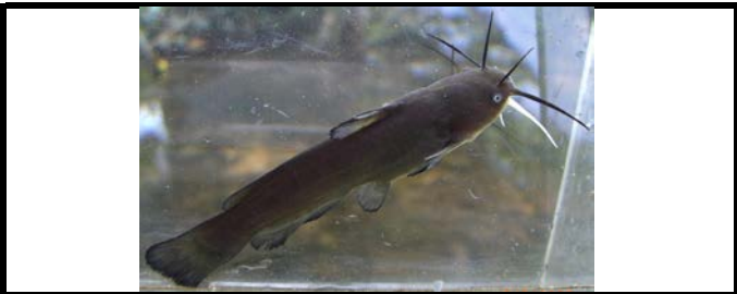
Yellow Bullhead Ameiurus natalis