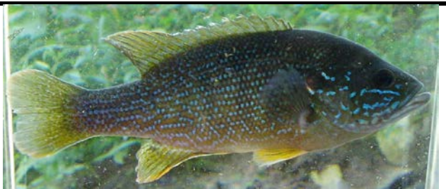
Green Sunfish Lepomis cyanellus