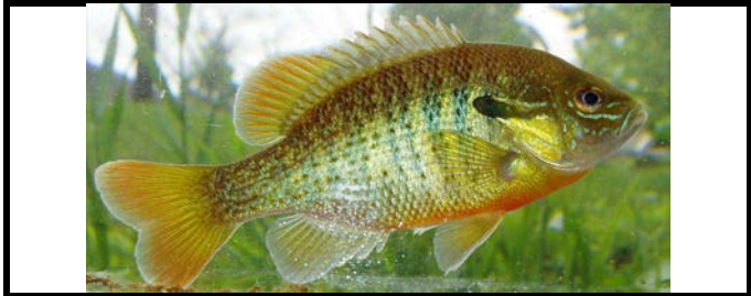
Redbreast Sunfish Lepomis auritus