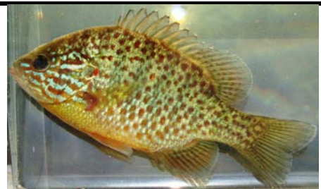
Pumpkinseed Lepomis gibbosus