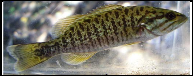
Smallmouth Bass Micropterus dolomieu