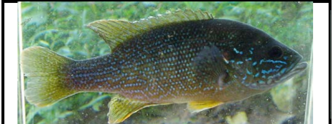
Green Sunfish Lepomis cyanellus