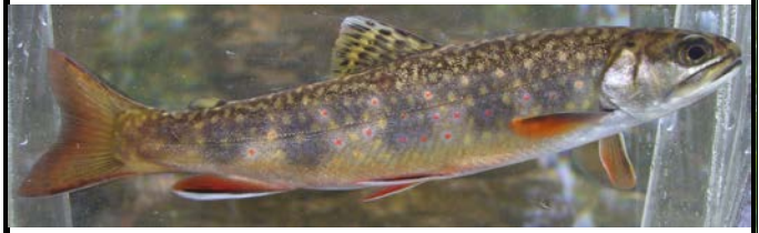
Brook Trout Salvelinus fontinalis