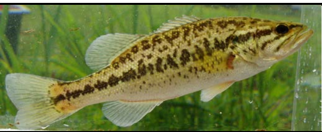
Largemouth Bass Micropterus salmoides