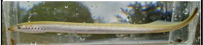
American Brook Lamprey Lampetra appendix