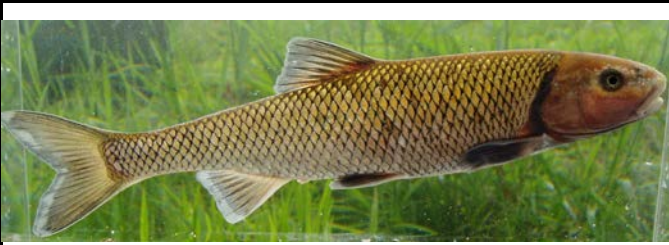
Fallfish Semotilus corporalis