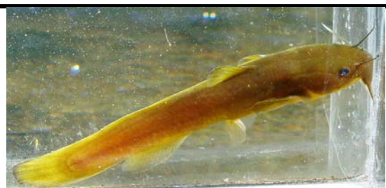
Margined Madtom Noturus insignis