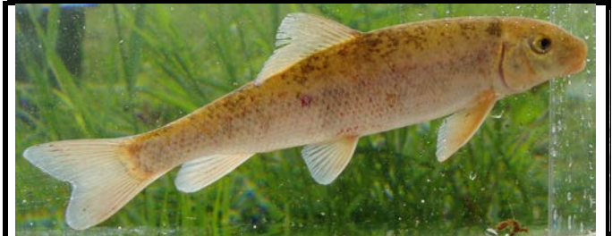
White Sucker Catostomus commersoni