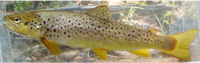
Brown Trout Salmo trutta