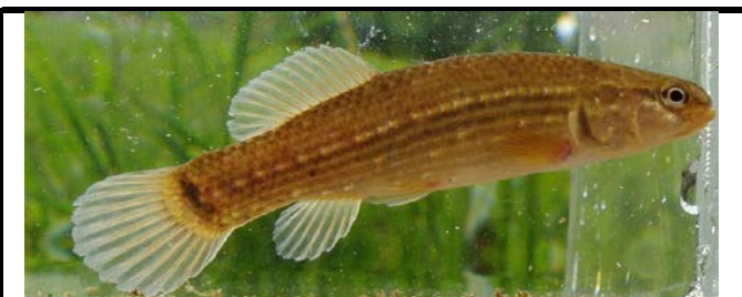
Eastern Mudminnow Umbra pygmaea