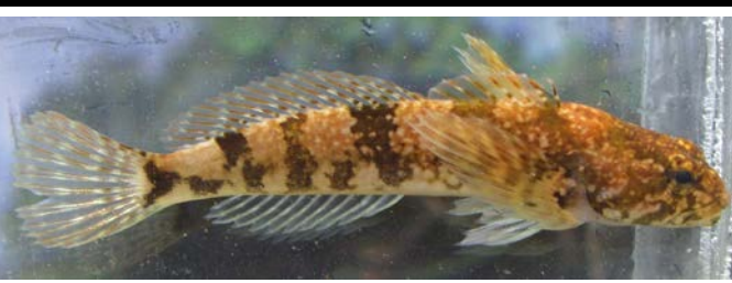
Slimy Sculpin Cottus cognatus