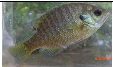
Bluegill Lepomis macrochirus