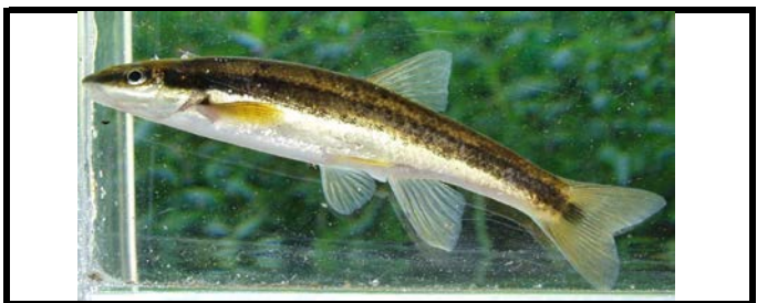
Blacknose Dace Rhinichthys atratulus