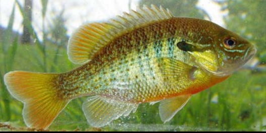
Redbreast Sunfish Lepomis auritus