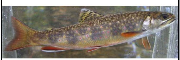
Brook Trout Salvelinus fontinalis