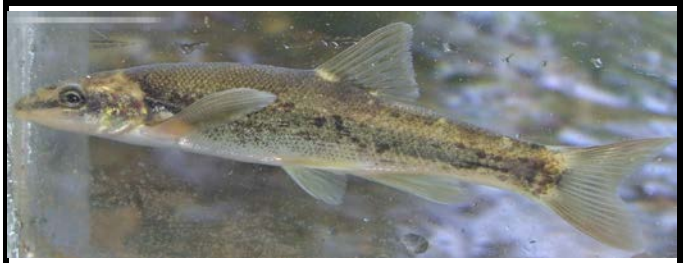
Longnose Dace Rhinichthys cataractae