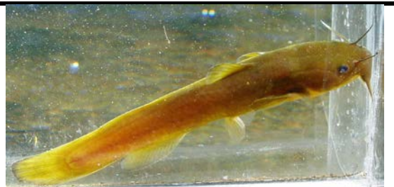
Margined Madtom Noturus insignis