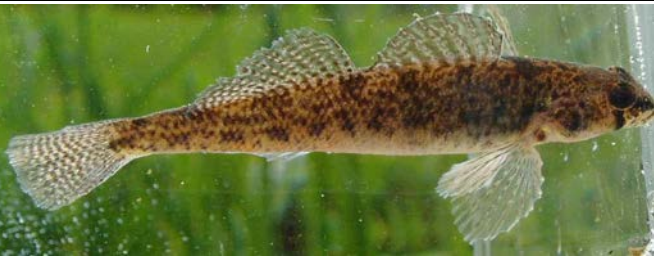
Tessellated Darter Etheostoma olmstedii