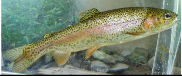
Rainbow Trout Onchorhynchus mykiss