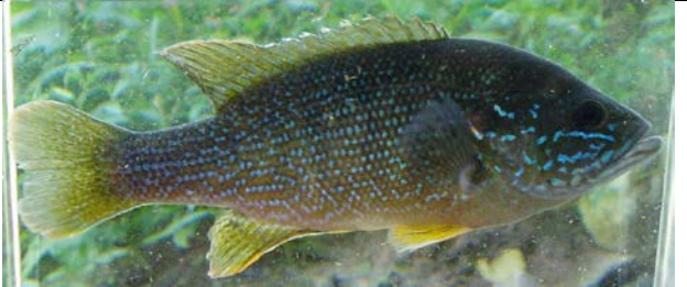
Green Sunfish Lepomis cyanellus