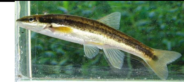
Blacknose Dace Rhinichthys atratulus