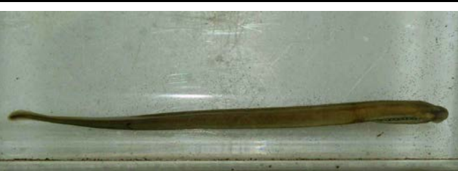
Sea Lamprey Petromyzon marinus