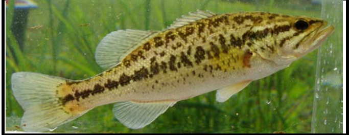
Largemouth Bass Micropterus salmoides