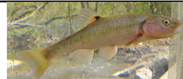
Creek Chub Semotilus atromaculatus