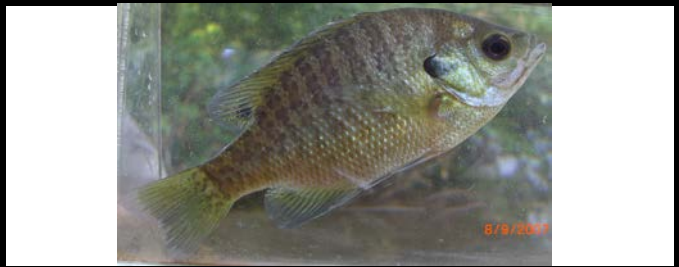
Bluegill Lepomis macrochirus