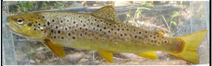
Brown Trout Salmo trutta