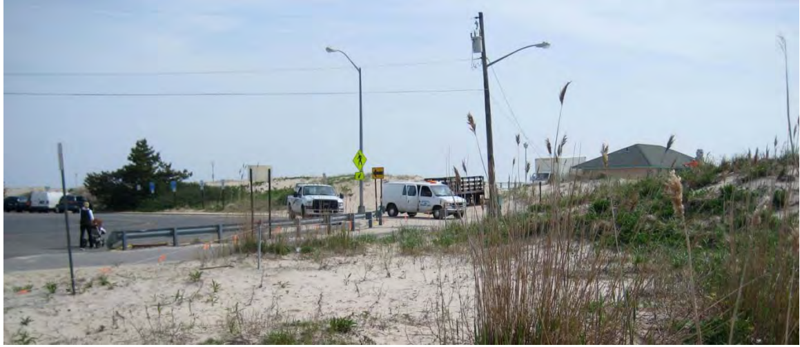
Entrance to Brown Avenue Beach