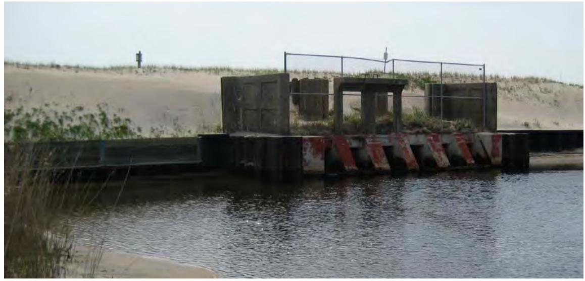
Stormwater outfall, pond side