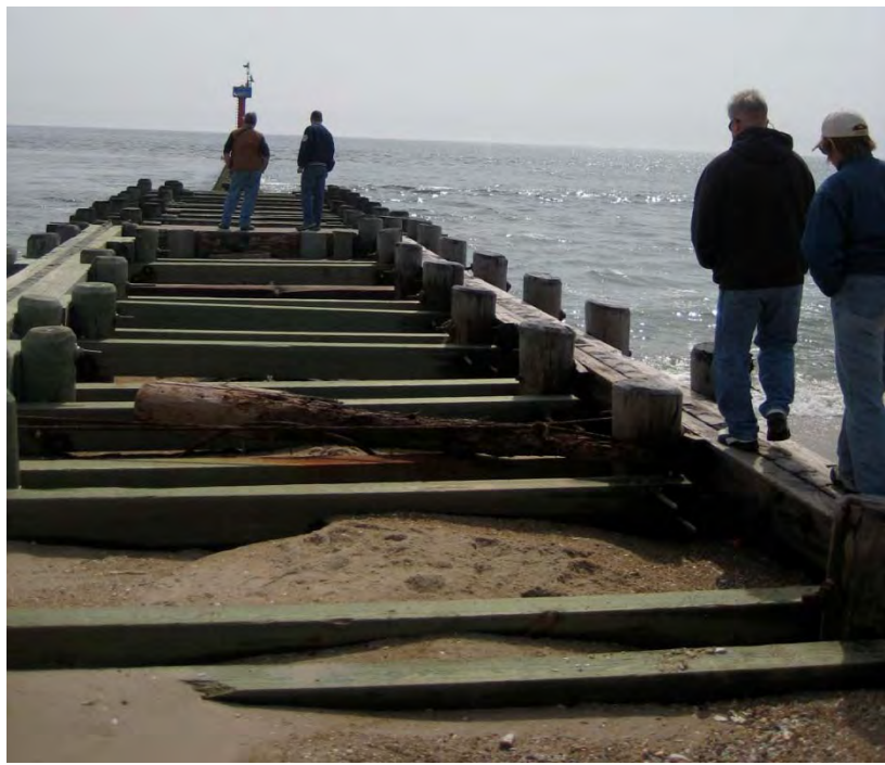
Stormwater outfall pipe, Atlantic Ocean side