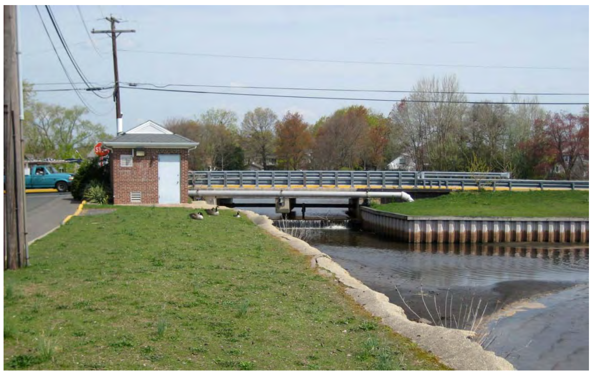
(Wreck Pond with view of weir & Black Creek)