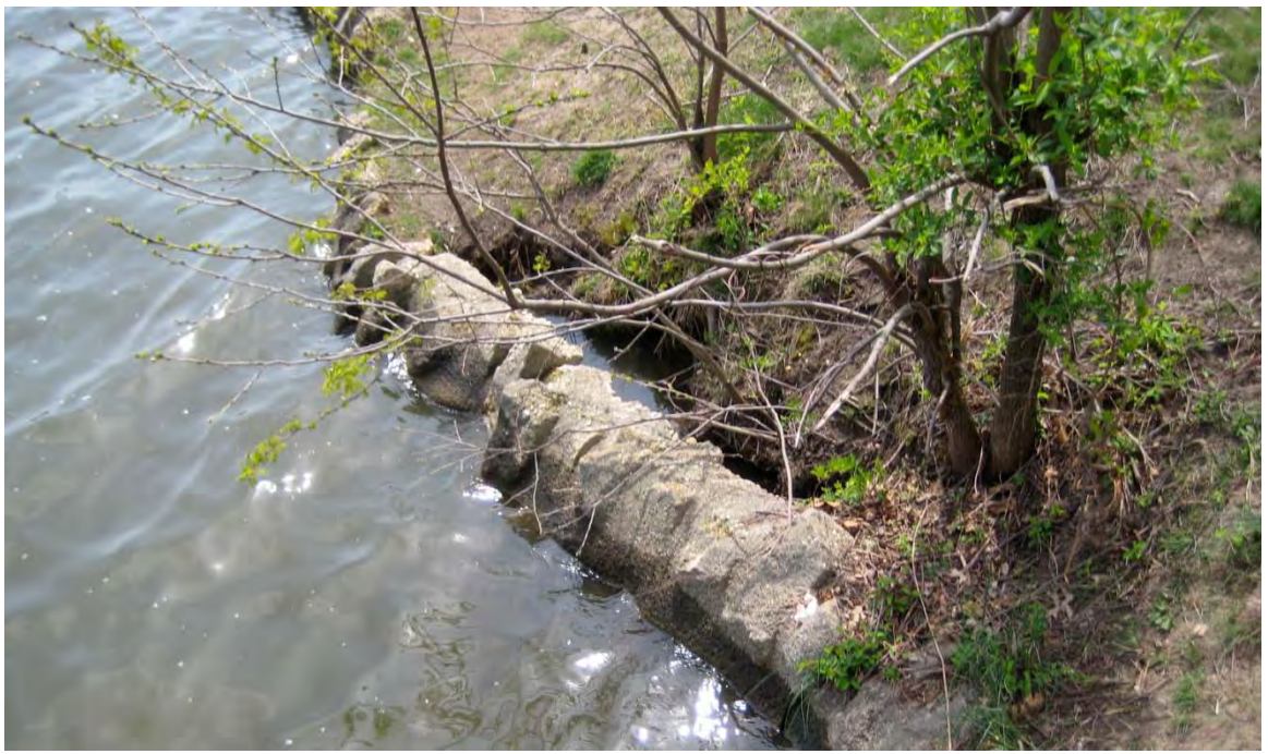
Streambank erosion in Spring Lake