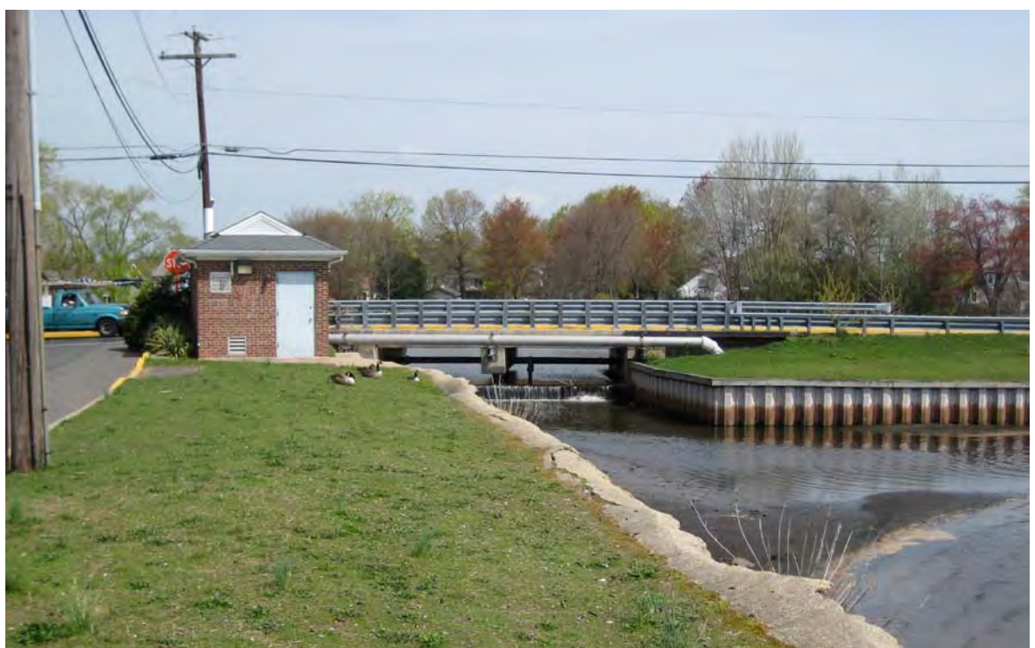
Sedimentation in Wreck Pond, April 2010

U.S. Army Corps of Engineers New York District 26 Federal Plaza New York, New York 10278-0090