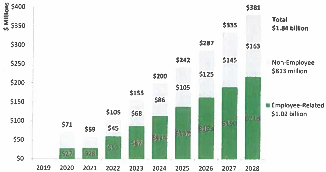
Figure 3.1: Additional Operating Expenditures in New Jersey due to Form Change, 2019-2028

Source: ESI analysis of Horizon projections